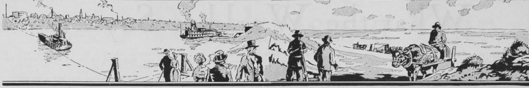
Early Winnipeg as viewed from St. Boniface across the Red River in 1889