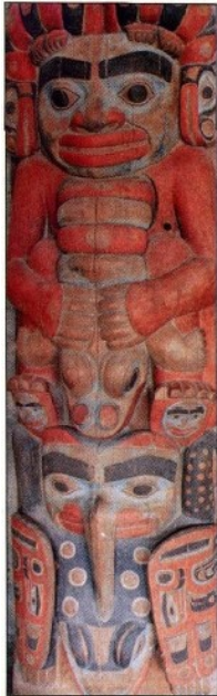
Figure 3. The Wormwood Post—one of four posts from the Whale House.

To complicate the matter further, I would like to explore a third manifestation of a totem pole: the totems found within the Whale House in a small Tlingit village in southeastern Alaska. I draw on these totems to add an international and comparative layer to the Canada totem and the Wonderbird totem. The following case reflects the aspirations of Article 31 of UNDRIP , which calls for Indigenous control and protection of cultural expressions.