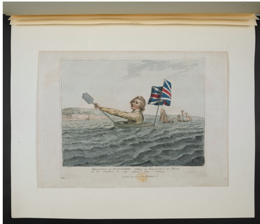
Fig. 1. Lunardi on the Thames