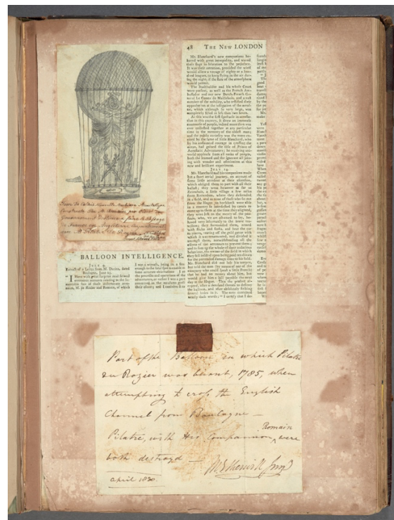
Fig. 2. De Rozier's Burning Balloon, "Collection of clippings. etc., relating to aviation: a scrapbook. 1780-1850," 139413, Aeronautica Collection: Prints and Ephemera, The Huntington Library, San Marino, California.

Foley's Garden from Banks's ballooning scrapbook with a page from one of the scrapbooks held by the Huntington Library ("Collection of clippings relating to aviation: a scrapbook, 1780-1850"). This juxtaposition highlights the spectacle of ballooning disaster. This isn't a subject of particular focus in Banks's collection, but it is in the Huntington scrapbook's collection ("Collection of clippings relating to aviation: a scrapbook, 1780-1850"). One page from the Huntington scrapbook contains a scrap from the balloon that went up in flames during the aeronaut De Rozier's disastrous flight. (Fig. 2: De Rozier's Balloon) Such souvenirs provide a material connection to these spectacles. When juxtaposed with Banks's page of a similar failed flight attempt (albeit with no fatalities), we can see the compilers's strategies and unique takes on such events. While Banks is documenting in a matter-of-fact way the events that occur, the expense suffered, and the materials lost, the Huntington compiler is more interested in the sensational.