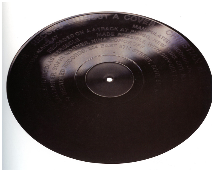
Figure 1: Christian Marclay, Record without a Cover (1985), black vinyl, first edition, 12 inches (30.4 cm) diameter. © Christian Marclay. Courtesy Paula Cooper Gallery, New York.

not because I am interested in “pure” theoretical destruction (for example, Martin Heidegger’s “ Destruktion ” of Western metaphysics), but because destruction as a link between medium and message calls for types of conceptual precision that theory seeks to provide. At issue here are the senses of destruction that converge in aesthetic practice, senses that can be isolated outside and inside Marclay’s corpus, where both in his turntablist performance on Sanborn and Holland’s Night Music in 1989 and in “Guitar Drag” ten years later, different but related articulations of sound and destruction appear. Art (and) destruction re(in)volve him.