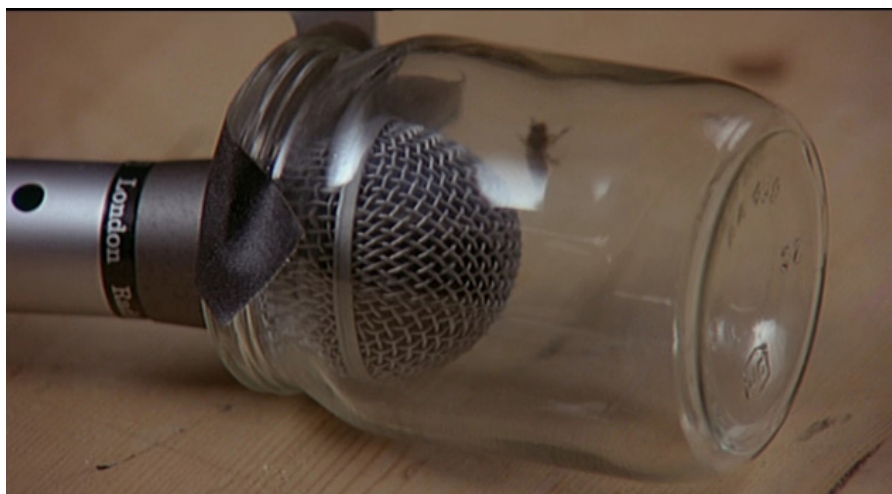
Figure 3: The sound of a wasp buzzing. The Shout (Jerzy Skolimowski, Recorded Picture Company, 1978).

The film The Shout also differs from the story in that the modern artist Francis Bacon is a central point of reference. 5 In 1929 when ‘The Shout’ was first published, Bacon was an interior designer creating furniture. The only art referenced in the short story is seemingly classicist. In Graves’s tale, Rachel tells Richard she had a dream similar to his, about a Black man “who wore a blue coat like that picture of Captain Cook” (Graves 2008, p. 9). 6 The Black man in the blue jacket, part of naval dress uniform, also appears in the film adaptation. The actor in this non-speaking role is uncredited, another nameless ‘exotic’ extra burdened with representing alterity. 7 The First Nations Australian of the film, as a figment of the European imaginary, functions to signal primitivism, to stand for mystery and difference. The shout from which the film takes its title is said to originate with this man, it is a vocal skill that Crossley learnt while living with First Nations Australians and has now brought back to England. Acoustic references to the music of Australia’s First Peoples are also present. In one scene, Rachel is cutting roses and the noise of a wasp buzzing