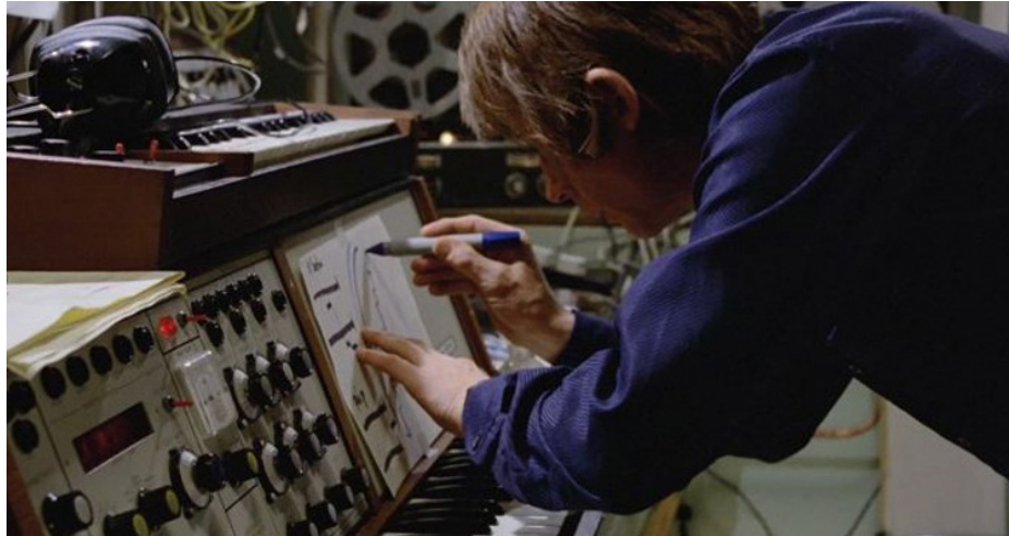
Figure 12: Audio technology and possibility. The Shout (Jerzy Skolimowski, Recorded Picture Company, 1978).

seems to signal the force of the vertical (Ahmed 2006, p. 107). 47 The shout therefore demands a queer orientation for its successful generation. In this, it echoes the scream in Bacon's paintings. In Bacon's paintings, the scream registers pleasure, it is an effect of queer sexual practices. The shout in the film, by contrast, is not a record of ecstasy but its cause . Anthony is overcome by Crossley's noisy ejaculation, falling in a faint, a sonically induced swoon. 48 The other men who buckle at Crossley's shout can similarly be read as exhibiting post-coital quiescence, as victims of a little death ( la petite mort ), rather than of the literal death a straight reading of The Shout invites. 49