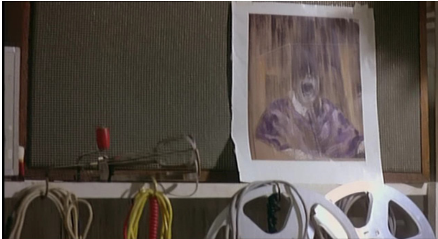
Figure 5: Francis Bacon, Head VI , 1949. The Shout (Jerzy Skolimowski, Recorded Picture Company, 1978).