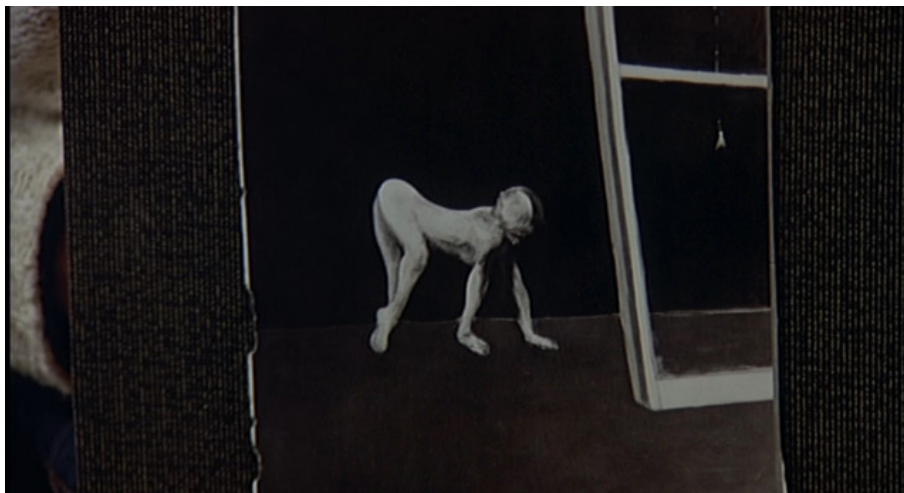
Figure 7: Francis Bacon, Paralytic Child Walking on All Fours (From Muybridge) , 1961. The Shout (Jerzy Skolimowski, Recorded Picture Company, 1978).