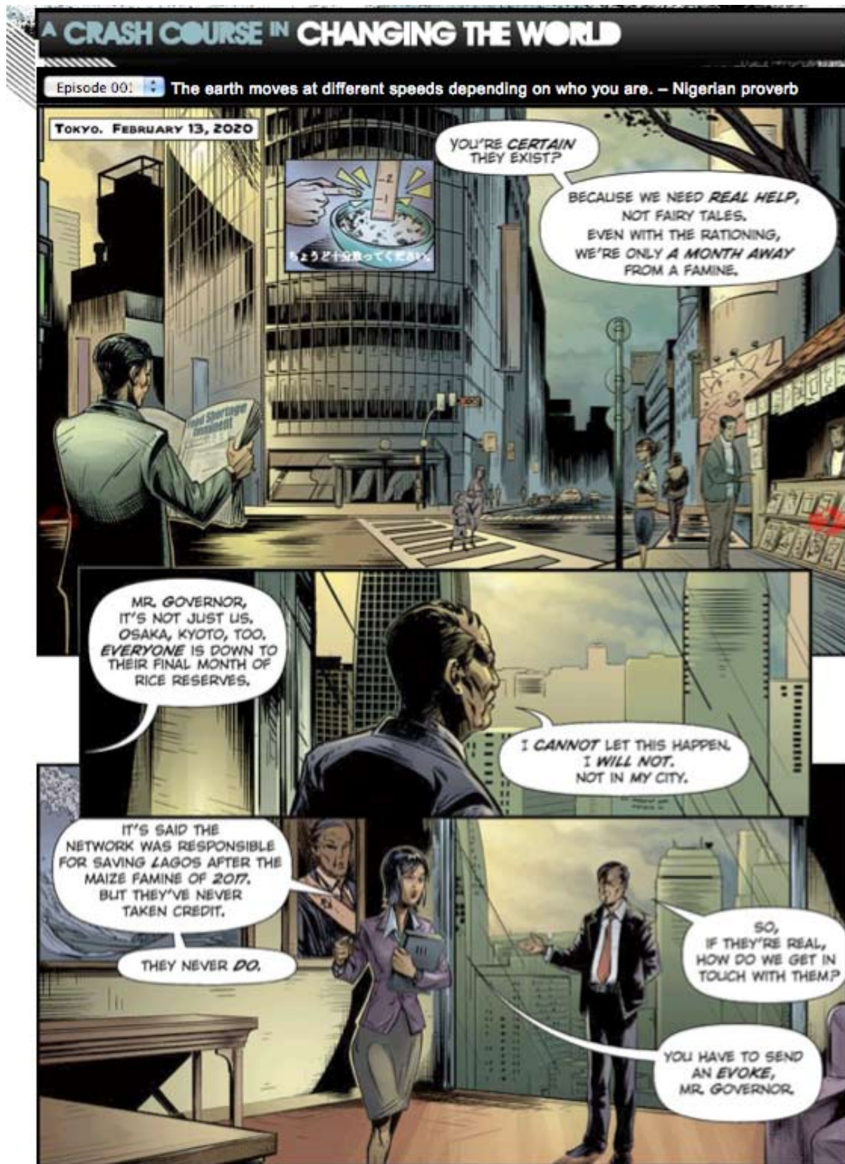
Figure 2: Evoke Comic Panel, Episode 1, Page 1