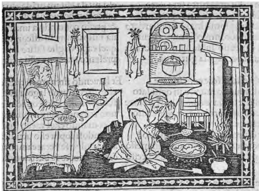
Figure 3. Carnival, Contrasto di Carnesciale e della Quaresima (Florence: Lorenzo Morgiani and Johann Petri, ca. 1492–95), 4°, woodcut. ©British Library Board, IA.27918, sig. a1r (detail).

1494 in Florence and reprinted several times in sixteenth-century Venice. 38 Here one finds Carnival in the guise of a glutton eating and drinking at a table, while an attendant is roasting chicken in a kitchen filled with plucked poultry hanging from the walls (fig. 3). The fact that Leandro also illustrated a kitchen abundant with poultry and a figure drinking wine in February demonstrates the affinity of the canvas with this popular carnivalesque imagery (fig. 1).