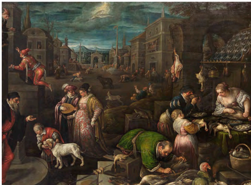
Figure 1. February , Leandro Bassano, The Twelve Months , before 1595, oil on canvas, canvas size 144.5 × 190 cm. Inv. Gemäldegalerie, 4293.

in Vienna and the Prague Castel Picture Gallery. 6 Based on the accounts of Carlo Ridolfi, scholars have identified Leandro's Months with the cycle sent by Jacopo Bassano to Emperor Rudolf II (1552–1612). 7 The two preserved series are in accordance with the encyclopedic style of the Bassano brothers, manifested through the borrowing of elements from different sources, from prints to previous repertories of the workshop, and elements from Flemish artists, displayed in densely populated landscapes.