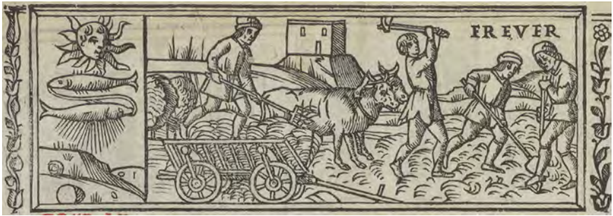
Figure 7. February , in Missale Romanum (Venice: Bernardino Stagnino, 3 July 1509), 4°, woodcut. Reproduced by kind permission of the Syndics of Cambridge University Library, F150.c.2.11, sig. *2v (detail).

An analysis of the missals printed before 1570 has identified five prototypes, all following the pattern that shows in February the spreading of manure and the resumption of the work in the field, and in March, the pruning of the vine (figs. 7–8). 64 Figure 6 classifies the Venetian Missalia Romana into three main categories. The blue-coloured bars represent the editions which include calendars not illustrated. The iconographic pattern showing the fertilization of the soil in February and the pruning in March is represented by green bars. The red bars chart calendars presenting an iconography still to be discussed. 65