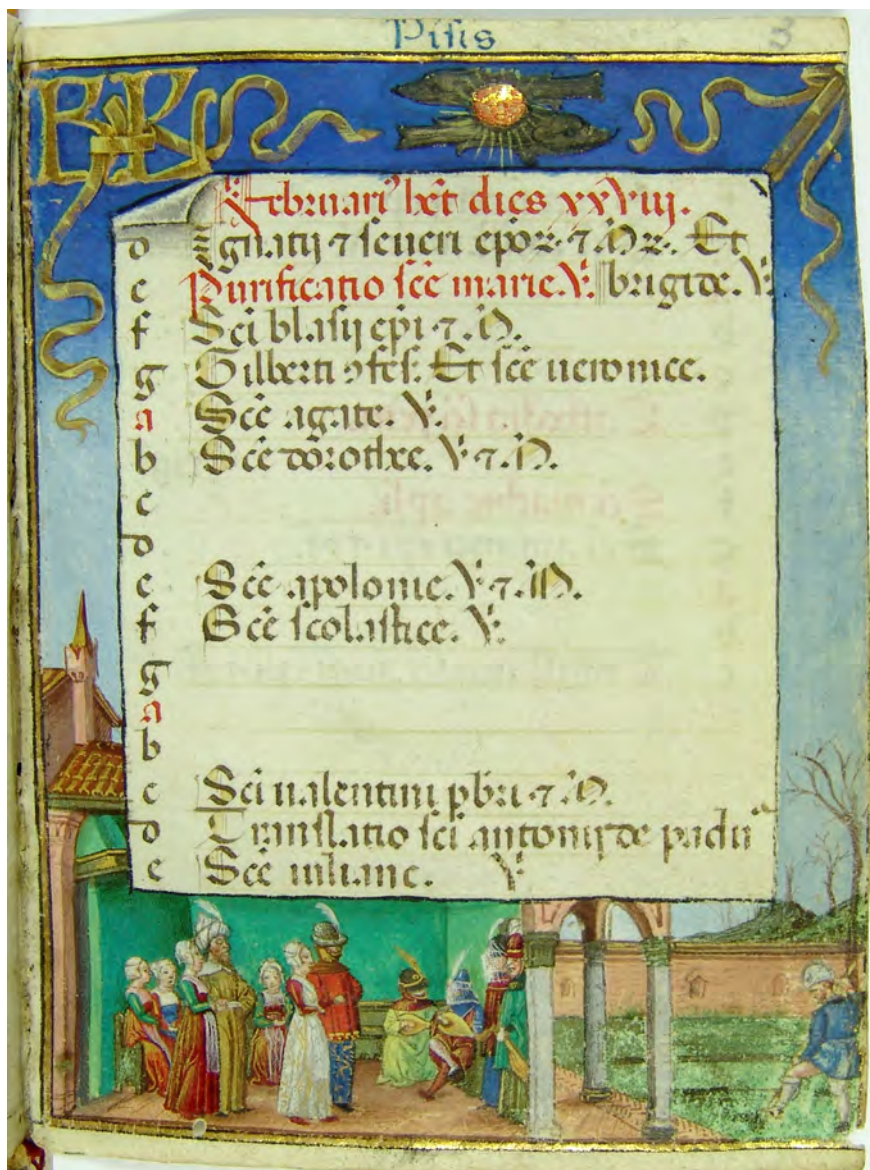
Figure 5. February , Cristoforo de Predis, Borromeo Book of Hours , Milan, ca. 1471. ©Veneranda Biblioteca Ambrosiana, MS S.P.42, fol. 3r.