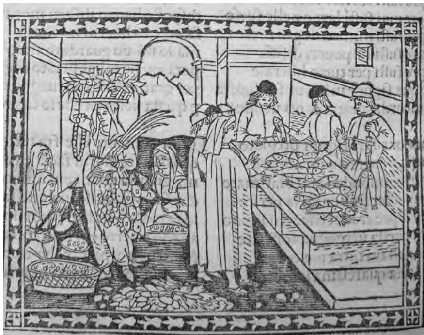
Figure 4. Lent, Contrasto di Carnesciale e della Quaresima (Florence: Lorenzo Morgiani and Johann Petri, ca. 1492–95), 4°, woodcut. IA.27918, sig. a8v (detail).

The luxurious foods of February are replaced by the mundane onions and garlic of March, when austerity takes the place of Carnival's wantonness and pleasures. Returning to the Florentine Contrasto , one finds the same correspondence between the month of March in Leandro and the woodcut representing Lent (fig. 4). Both images depict on the right the fish market; on the left, women selling products associated with Lenten restraint and fasting (fig. 2). 39 Already by the fourteenth century, Antonio Pucci evoked this shift in the foodstuff of