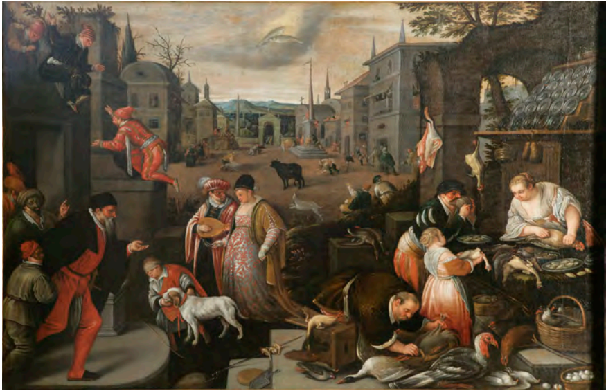
Figure 12. February, Leandro Bassano or his workshop, The Twelve Months, end of the sixteenth to the beginning of the seventeenth century, 80 x 121 cm.

the Bassano workshop. 94 Paintings of the commedia dell'arte were possibly intended for a non-Venetian public. Both Ferdinando I de' Medici and Rudolf II, who acquired such cycles, enjoyed theatrical entertainments by professional companies. 95 It is more convincing, however, that Leandro sought to convey and develop a didactic message in line with that of the Missal.