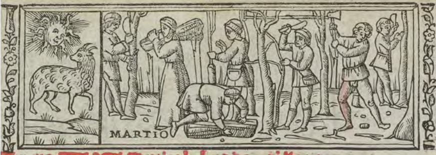
Figure 8. March , in Missale Romanum (Venice: Bernardino Stagnino, 3 July 1509), 4°, detail of woodcut. Reproduced by kind permission of the Syndics of Cambridge University Library, F150.c.2.11, sig. *3r (detail).