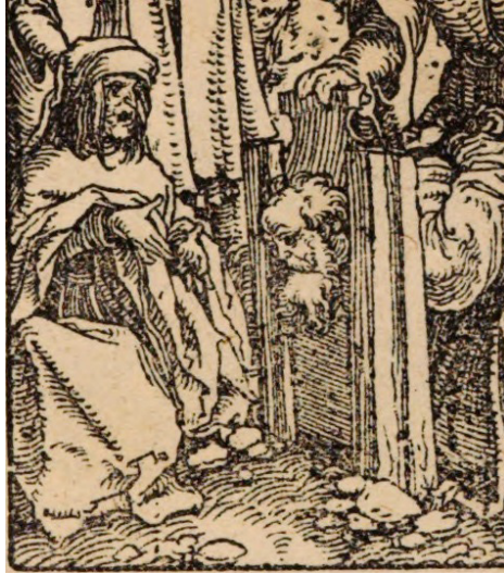
Figure 4. Anon., Ein glaubwirdige anzaygung des tods, Herrn Thome Mori, vnnd andrer treffenlicher maenner inn Engelland, geschehen im jar M.D.xxxv. (Augsburg: Heinrich Steiner, 1536), sig. [C4r], detail. Bayerische Staatsbibliothek München, Res/4 Biogr. 186 d, urn:nbn:de:bvb:12-bsb10199485-1.