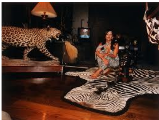
Figure 1. Daniela Rossell Untitled ( Ricas y Famosas ), 1999 C-print 50"x 60"