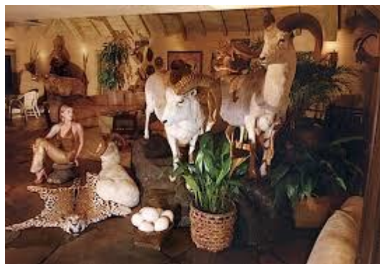
Figure 3. Daniela Rossell Untitled ( Ricas y Famosas ), 1999 C-print 50"x 60"