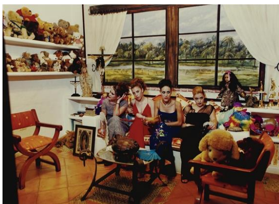
Figure 2. Daniela Rossell Untitled ( Ricas y Famosas ), 1999 C-print 50"x 60"