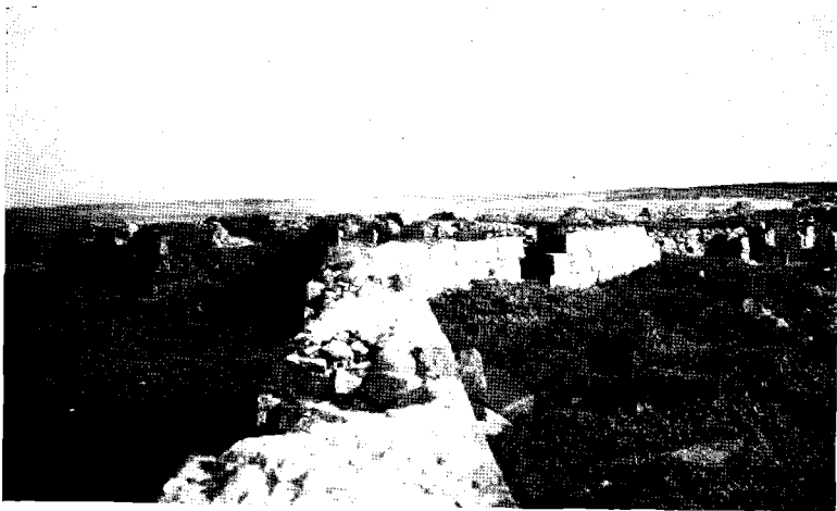
Fort Prince of Wales, Churchill, Man. View along the top of the walls (Photo., J. A. Campbell).