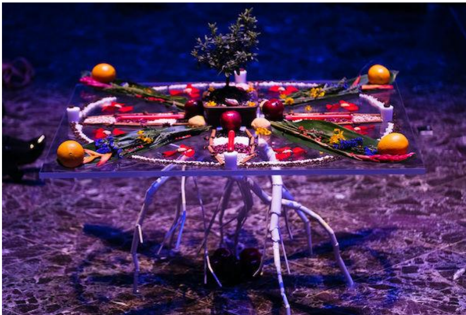
Altar in Zaccho Dance Theatre’s Love, A State of Grace. Grace Cathedral, San Francisco, CA, 2022.