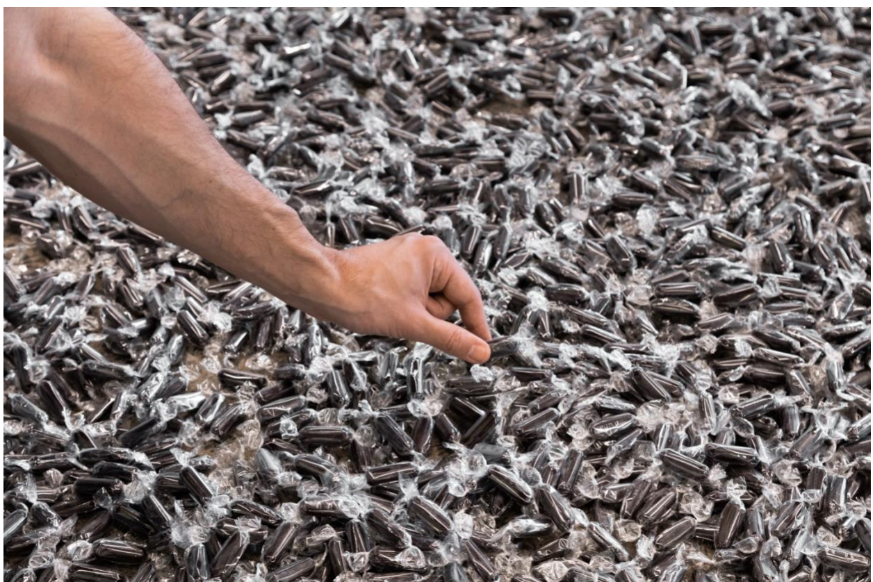
Felix Gonzalez-Torres, "Untitled" (Public Opinion), 1991, detail view, MOCA Toronto. Copyright Felix Gonzalez-Torres Foundation. Courtesy of MOCA Toronto. Photo: Laura Findlay.

LMC. I'm so fascinated by the tension that might lie within the works. For example, what might it mean by having "Untitled" (North) and "Untitled" (Public Opinion) in the same sightline or having both Summer and Winter as iterations of the exhibition. When I was visiting here in May, I also noticed a theme or maybe a tension between light and dark in the show. I'm thinking about how "Untitled" (Golden) refracts natural light and has its own metallic glimmer or how "Untitled" (North) harnesses electricity and emits light itself. Even "Untitled" 1989 has a reflective sheen to it. Then, you pair that luminosity with "Untitled" (Public Opinion) and "Untitled" (Shield). While these pieces have a sparkling quality due to their plastic wrap, they are the two pieces that aren't inherently metallic or luminescent—"Untitled" (Public Opinion)'s onyx-like candy base and "Untitled" (Shield)'s matte finish, where even the beige background appears a bit more dull in contrast with the stark white museum walls. Perhaps, in contrast with the other pieces, these two pieces are a bit darker in hue and maybe even in affective tonality.