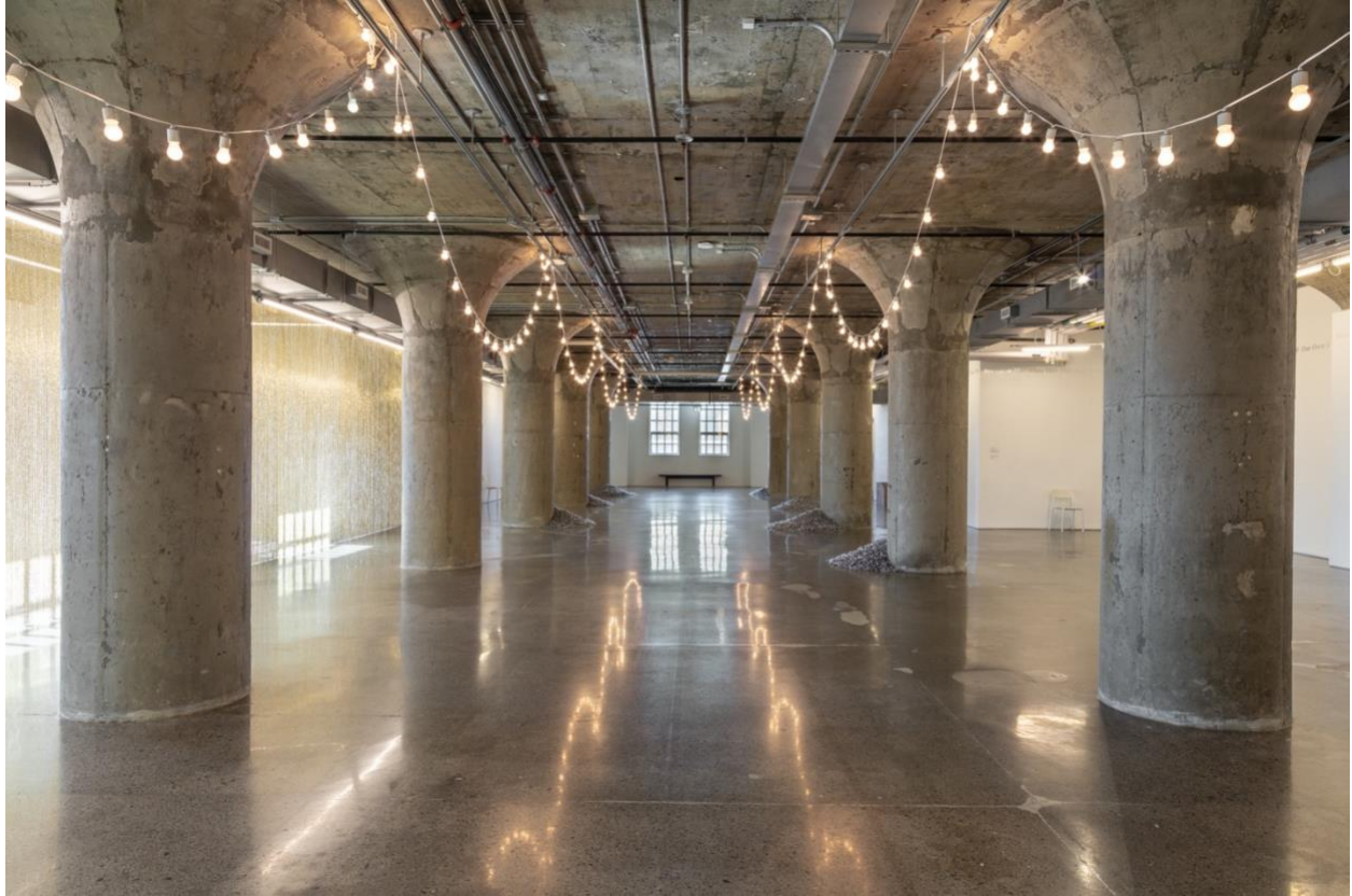
Felix Gonzalez-Torres, Winter, installation view, MOCA Toronto. Copyright Felix Gonzalez-Torres Foundation.

teddy bear and holds it in front of his face; this pose reveals a bruise on his left arm and ring on his finger. The piece is wrapped in a somewhat dingy plastic bag—all pieces perfectly aligned. Held up by small metal pins, this work's humble, delicate stature acts in contrast to the grandeur of "Untitled" (Golden) across the way. While the majority of the pieces are a feat of grand spatiality, even the 8 x 10 inch "Untitled" (Shield) brings a large-scale gravity to it. "Untitled" (Shield) does not have to fight for attention against the larger pieces: its coloration sits in stark contrast with the vast whiteness of the wall surrounding it, and its affective resonance envelops the spectator in tenderness.