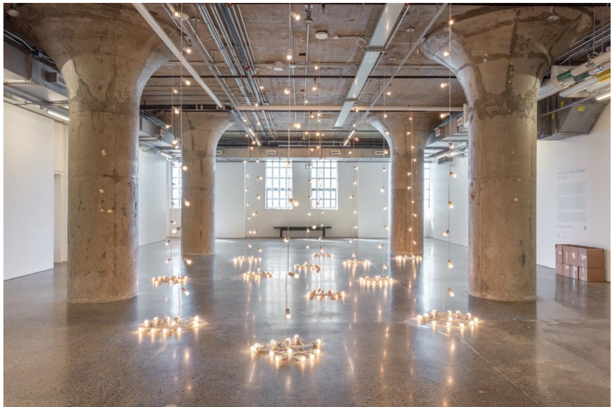
Felix Gonzalez-Torres, "Untitled" (North) , 1993, installation view, MOCA Toronto. Copyright Felix Gonzalez-Torres Foundation. Courtesy of MOCA Toronto. Photo: Laura Findlay.