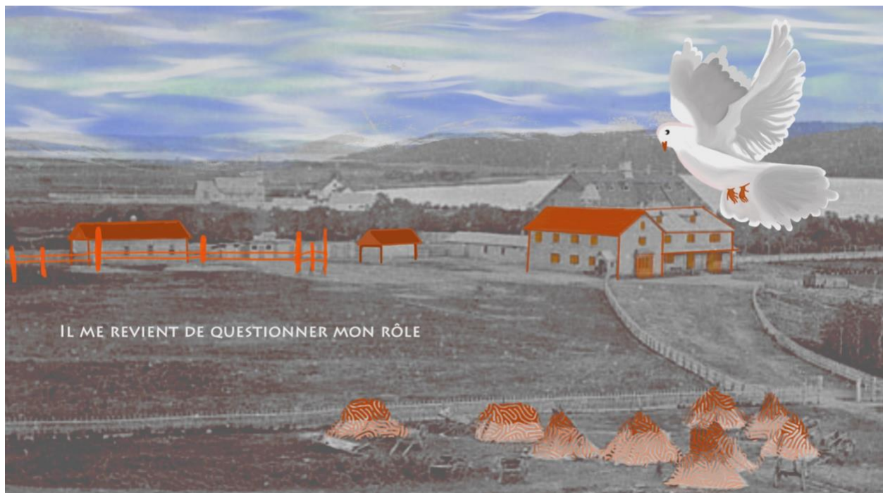
Video still from Honneur, la vérité, réconcilier, pour l'avenir, récit collectif , Gather Town. Original artwork by Gaëlle Issa, lyrics by Charlène Auré. Full video with original music by Gabriel Démosthène.

The final stage of our work took place in Gather Town. Our main concern was to create a warm and welcoming environment—a safe space where people can share their feelings, ideas, and get involved in our extremely personal interpretation. The platform fulfilled this desire for us. We created a simple, peaceful space, divided into a variety of small colourful areas with plants and poufs, in which one could reflect alone or meet with others. Arrows were also used to indicate a path to access all the visuals such as a couple of documentary images, and other visuals illustrated by my teammate.