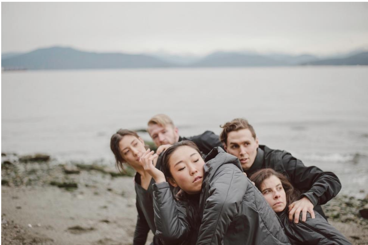
OURO Collective exploring the relation between movement and environment at Spanish Banks Beach in Vancouver.