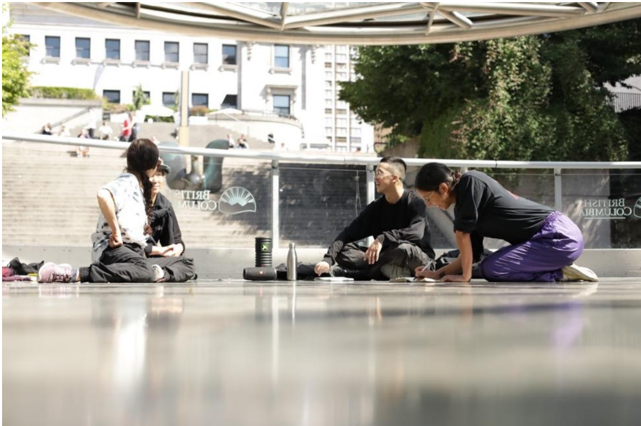
OURO Collective rehearsal for SOTTO 51 at Robson Square.

For several years, dancers and members of OURO Collective have been working and training in Vancouver’s Robson Square ice rink. The location, easily accessible by public transit, allows movers from different parts of the city to congregate, create, and exchange together. Robson Square remains one of the few free public spaces with shelter, contributing to an ever-growing dance community.