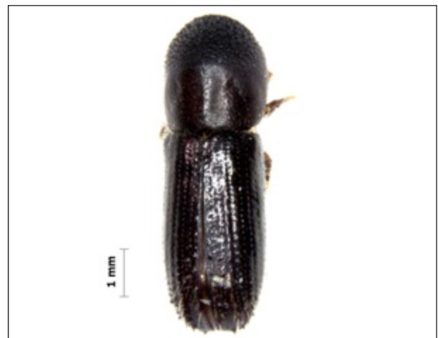
Figure 5. Xyleborinus attenuatus – dorsal view.