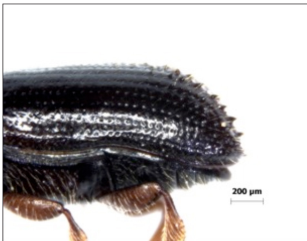
Figure 4. Xyleborinus attenuatus – lateral view of elytral declivity.