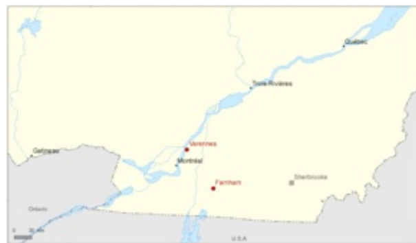
Figure 1. Map of Xyleborinus attenuatus records in Quebec, Canada (gray square – previous record; red circle – new records).

As a result of the 3-yr trapping survey of alien bark beetles, 16 specimens of X. attenuatus were captured as follows: 9-V-2011: three specimens at Farnham