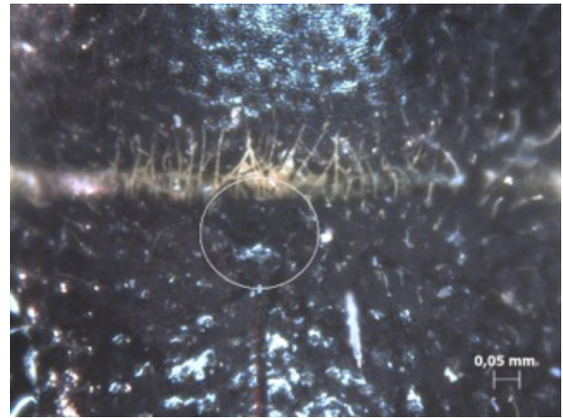
Figure 3. Anisandrus sayi – scutellum.