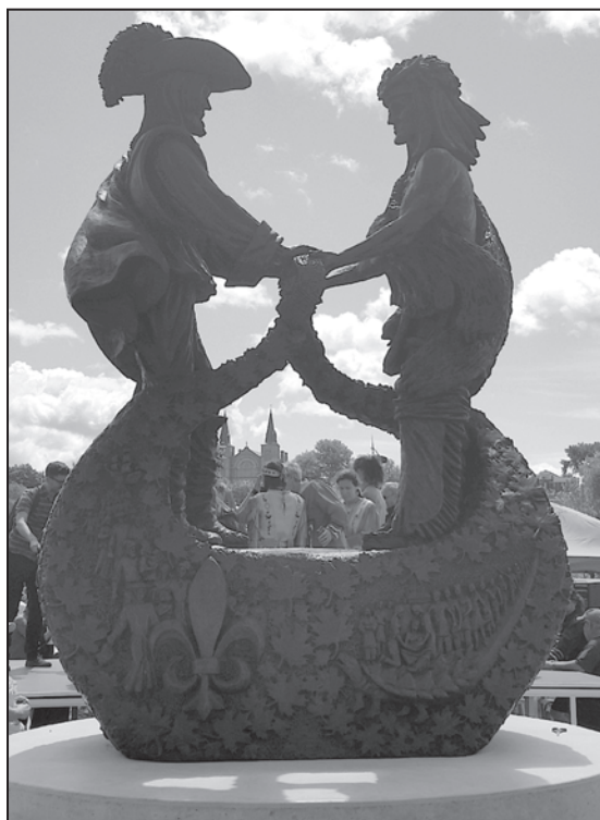
Figure 11—“The Meeting” Quadricentenary Monument, Penetanguishene Harbour.

The quadricentennial celebrations of Champlain’s arrival in Huronia demonstrate the distinctly altered attitudes towards the material representation of Indigenous populations in Canadian history. Unveiled on 1 August 2015 in Penetanguishene, “The Meeting” (Figure 11) portrays Champlain’s reception by Chief Aenon of the Huron-Wendat’s Bear tribe as a summit of two equals, breaking the tradition, according to sculptor