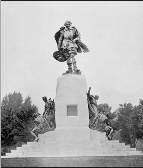
Left: Figure 4—Champlain Monument, Front View. [Source: Orillia Public Library, "Souvenir Booklet of The Champlain Monument at Orillia"]

Below left: Figure 5—Champlain Monument, "Christianity" Side Group. [Source: Orillia Public Library, "Souvenir Booklet of The Champlain Monument at Orillia"]