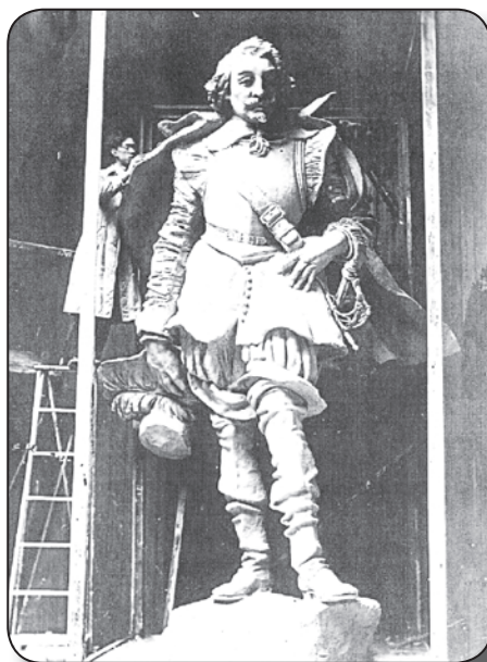
Figure 2—Original Clay Sculpture of Champlain.

that March “shows no real knowledge of the Huron Indians” and that “the features and costume might be those of Algerians or Mediterranean folk rather than of Native Americans.” In terms of the features of the Hurons, Barbeau emphasized that “I cannot recognize anything Huron-like or even Indian” in the “Christianity” panel. “Instead of a long pointed chin, thin lips, aquiline nose with a low tip,” he claimed, “the Hurons had a markedly receding chin, usually thick lips—specially the lower lip—, and often a broad spatulate-like nose at the tip.” Barbeau also noted that the full head of woven hair for the Hurons in March’s model was inaccurate.