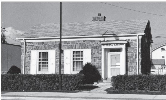
Fig. 2 Colwater Public Library, 1980