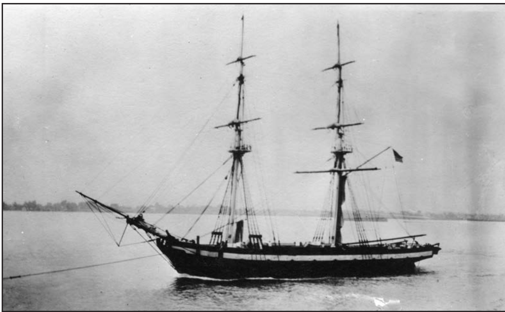
A rare photograph of the US Niagara, Perry's flagship at the Battle of Lake Erie. The Niagara was similar in size and configuration to the Nancy.