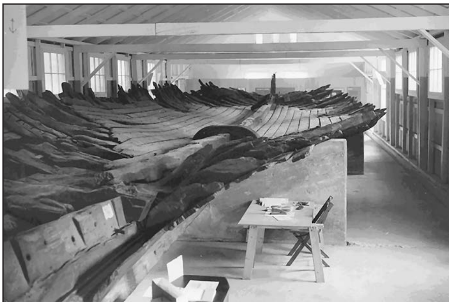
The burnt remains of the hull of HMS Nancy in the original museum shed, Nancy Island, Wasaga Beach, Ontario (undated).

nally attached to the Nancy Island site had become anachronistic. The broader context for this process was the slow but steady postwar collapse of the British connection as a central pillar of Canadian identity. 87 This in turn was reflected in a growing detachment on the part of professional historians from the War of 1812 (what some have taken to calling the “forgotten war” 88 ) and the thorough disintegration of the myth of 1812 as a loyalist war at the heart of British-Canadian identity. Barry Gough’s recent history of the Nancy , for instance, avoids