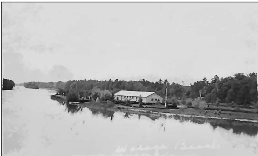
Postcard image of Nancy Island with the original shelter (undated). A footbridge now connects the island, which has been substantially enlarged to accommodate the new museum and theatre, to the west bank of the Nottawasaga River (at rear of photo).