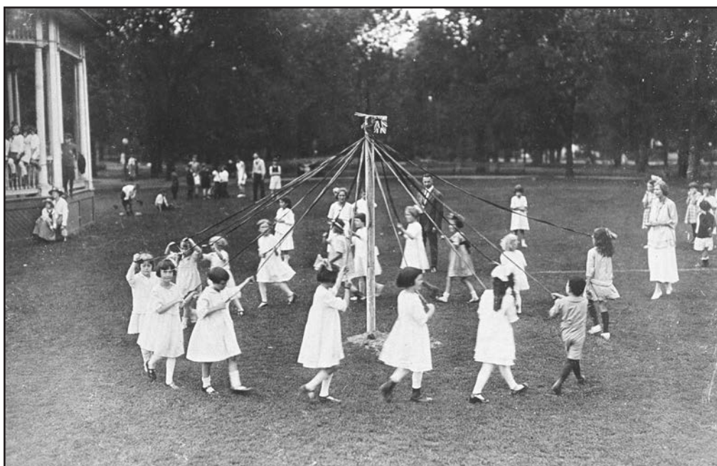
Figure 3: Maypole Dance, circa 1920, PUC Collection, The University of Western Ontario Archives, RC42067.

batt Park. 80 As an alternative source of revenue for the park, the women's league was welcomed as a fruitful replacement to circumvent the effects of the Second World War that led to the diminishment of the men's leagues. The inaugural league consisted of four teams, each one representing a ward of the city: The Shamrocks from the Southeast, The Cardinals from the Northwest, the Eagles in the South, and the Royals in the East. Many of the women interviewed for this study went on to play for one of these city teams.