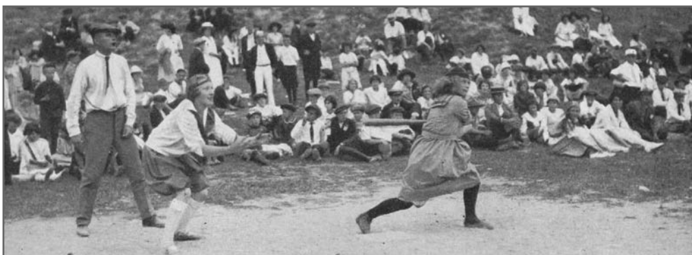
Figure 1: Girls' softball game 1921. Public Utilities Commission, 44th Annual Report (London, Ontario, 1922), 3. 51