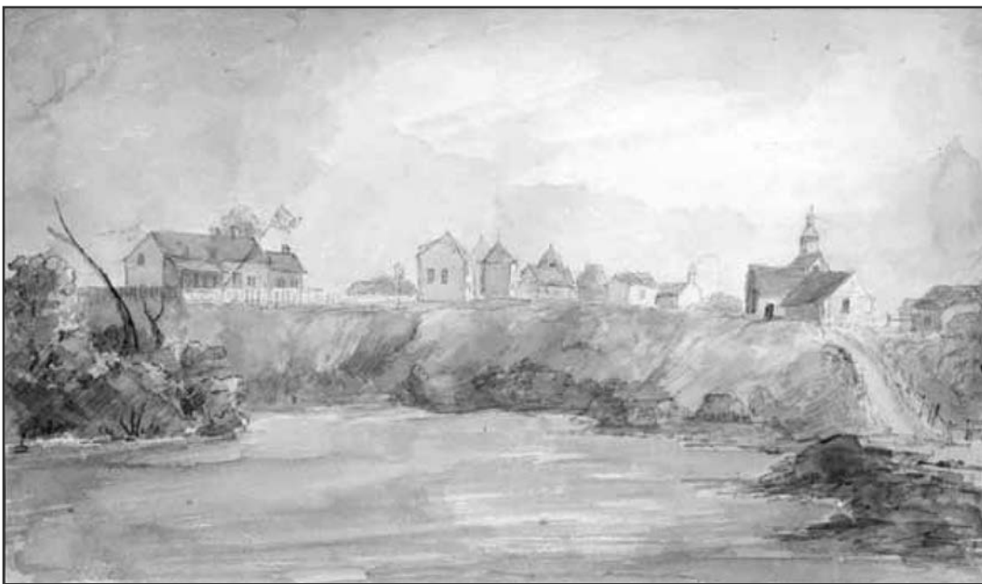
Mohawk Village on the Grand River [ca. 1793]. Watercolour. Simcoe Family papers, LAC F 47-11-1-0-109.