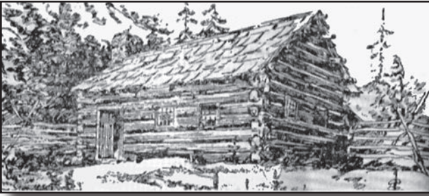
Smith's Tavern, near Hamilton, 1795. E.G. Guillet, Pioneer Inns and Taverns . Backwoods taverns offered the most basic of accommodations.

or two room log-cabin, located in the backwoods and providing only the simplest fare and accommodation (salt pork and whiskey, for example and the likelihood of shared beds), such as Smith's Tavern, above, shaped colonial public life differently than the solid minor houses that numerically dominated in the trade, and the handful of truly principal taverns or hotels that belonged primarily in urban centres. Travellers and colonists alike understood these backwoods taverns to be temporary affairs, dictated by the frontier conditions of settlement, and hardly ideal as the venues of public life and public entertainment.