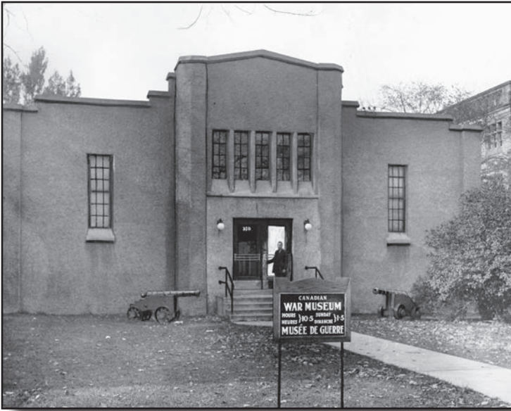
The Canadian War Museum on Sussex Street in Ottawa, October 1945.

to confiscate the weapons and impose stricter firearms legislation across the country.