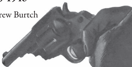
Illustration from Inside Detective magazine, Nov. 1937.