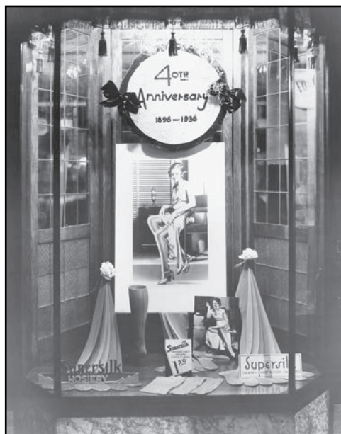
Fortieth anniversary window display, 1936.