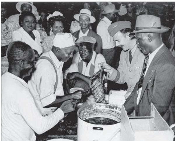
"Late Night Snack": Emancipation Celebration festivities at Jackson Park, Windsor, c.1944.

neither collection is processed at the time of writing, it is anticipated that they will be ready for researchers in the spring of 2007.