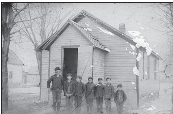
Children in front of the Marble Village Coloured School, c.1900. Black Ontarians banded together to create their own schools while, at the same time, challenging their exclusion from the public schools.

a given point. Archives staff may be able to offer advice once initial background research has been done. Details of many of the above-mentioned materials, including both private and government records, can be found by searching the Archives Descriptive Database located on the Archives