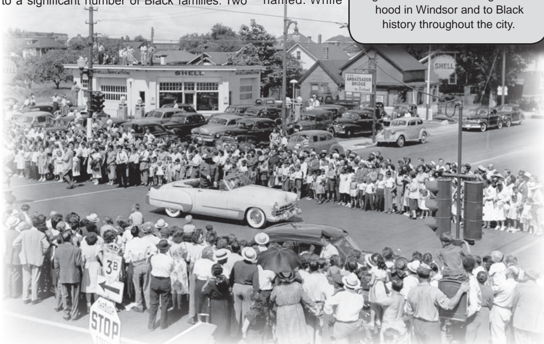
Emancipation Celebration Parade on Ouellette Avenue at Giles Boulevard, Windsor, c.1950.

Records relating to the residents, past and present, of the McDougall Street Corridor Neighbourhood in Windsor and to Black history throughout the city.