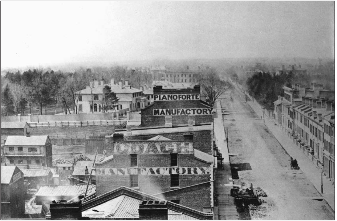
Toronto from the top of the Rossin House Hotel, looking west along King Street West in 1856. Note the Pianoforte "Manufactory" and Coach "Manufactory." The language is significant as historically "manufacture" preceded mechanized factories by several decades (Marx, 1887; Blumin, 1976). It was a transitional form in which large numbers of craftsmen were organized to work together in sequence or to do the same kind of work (making needles, etc.). According to Blumin, a large number of workers appeared before the advent of factories. In some ways, they were craftsmen, but in a state of degradation.

There can be little doubt that by the 1880s much work formerly conducted in small workshops was undertaken in factories. The important change was an increase in the size of the workplace. In 1870, thirty-eight per cent of Toronto's industrial work force was employed in factories of over a hundred workers. Another twenty-one per cent worked with between fifty and ninety-nine other employees, and eleven per cent worked in shops with between thirty and forty-nine other employees. 41 In