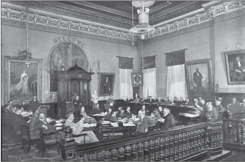
Toronto's city hall interior showing council in session, 10 July 1899. This was a historic moment, being the last council meeting in the 1844-1899 building.

These findings are significant because they suggest that economic change and class transformation impacted on political institutions through the mechanism of class conflict. The economic dimension of proletarianization, namely dispossession and downward social mobility, was paralleled by political ex-