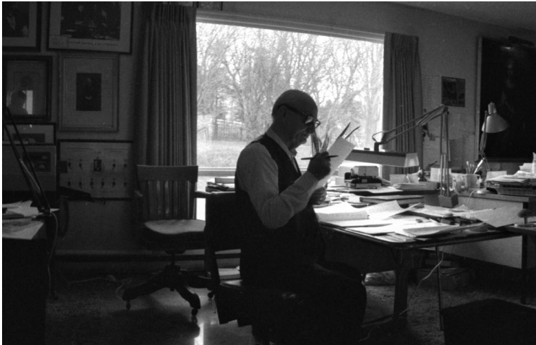
Figure 1. Former Premier Joseph R. Smallwood at work in the main office of The Encyclopedia of Newfoundland and Labrador in 1979.