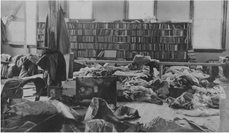
Figure 3. Upper floor of Grenfell School used as dormitory, c. 1911–1913 (The Rooms, Provincial Archives Division, MG 175 IGA Photograph Collection, Series VA 129 Beeckman Jousseauameam Delatour albums, VA 129-29.2).

As with other observers, Cutter emphasized the need for reading material during the winter months; however, she also recognized the need for good print and good illustrations that would be more easily read by people whose eyes “were often weakened by the glare of the snow.” Another need was for reading rooms. She also believed, owing to requests in St. Anthony from the “fairly prosperous” southern portion of the island, that the Seamen’s Institute in St. John’s should act as headquarters for the south. Indeed, the building is “similar in all respects to our Young Men’s Christian Association buildings,” she told her mainly American readers, and it contained a reading room and small library. However, because the book collection of standard works — donated by Andrew Carnegie, Dr. Henry van Dyke, and Francis Sayre — needed oversight that would allow it to become a circulating department to people of St. John’s, she proposed that a permanent librarian would spend winters in the city on this work for the southern part of Newfoundland, with towns paying a fee for expenses. 41 Cutter’s report concluded by stressing the changing nature of the mission’s role in the development of libraries for people of Newfoundland: