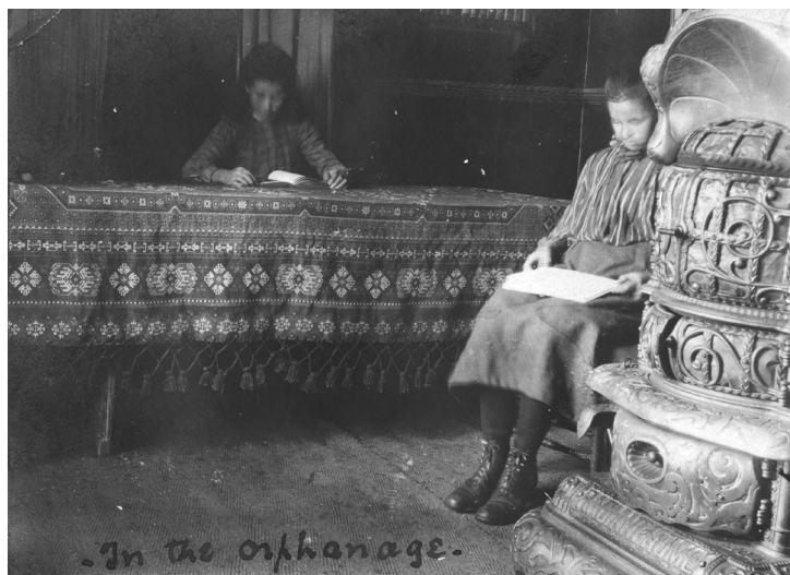
Figure 2. Two girls reading in the orphanage, c. 1908 (The Rooms, Provincial Archives Division, MG 175 IGA Photograph Collection, Series VA 118 Grenfell Mission Staff Photograph Albums, VA 118-45.1).

appealed for a permanent head librarian, with associated salary and expenses, to handle the work. 38 For her part, Cutter aimed to obtain funds to bring "one of the promising Mission girls" (that is, from Grenfell's orphanage) back to the United States for library training to return her to Newfoundland "a full-fledged librarian" to oversee the work 39 (Figure 2). She reported that the top floor of the schoolhouse was the distribution centre, from which all but 200 books had been distributed by summer's end in 1914 (Figure 3). Her work was left in the hands of temporary and inexperienced workers, but her detailed outline allowed the continued circulation of travelling libraries of 50 books that were loaned to a community for one year. The books comprised hygiene, travel, history, basic sciences, fiction, and "a goodly number of juveniles." The latter, Cutter remarked, were "particularly suited to the simple lives of the people, and are greatly enjoyed by the adults, in addition to affording a broadening scope and real pleasure to the children." 40