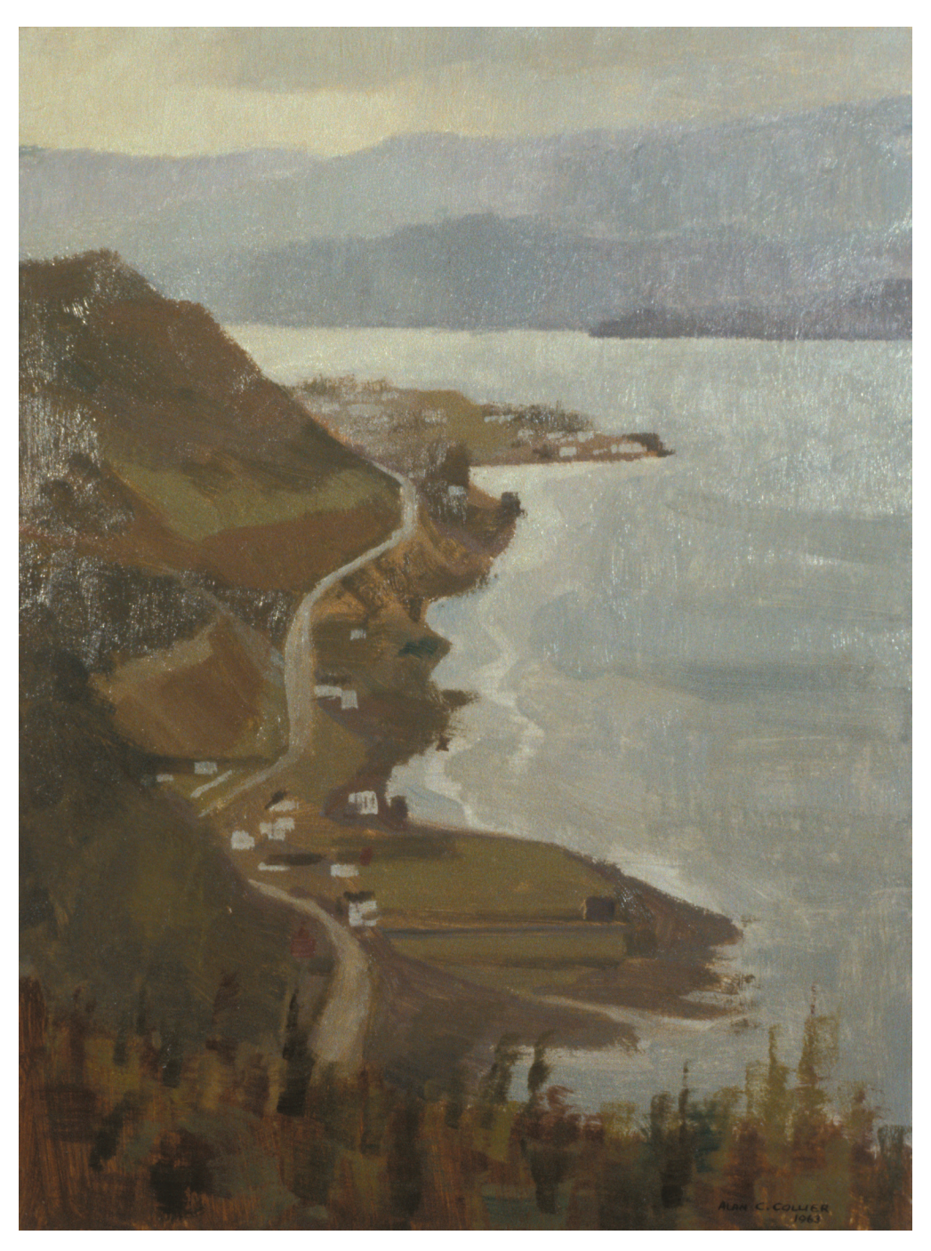
Alan Caswell Collier, Woody Point, Newfoundland, 1963 , oil on beaverboard, 40.6 cm h x 30.5 cm w x 0.3 cm d, The Ottawa Art Gallery, Firestone Collection of Canadian Art, FAC0280. Donated by the Ontario Heritage Foundation to the City of Ottawa. Published by permission of Ian Collier.