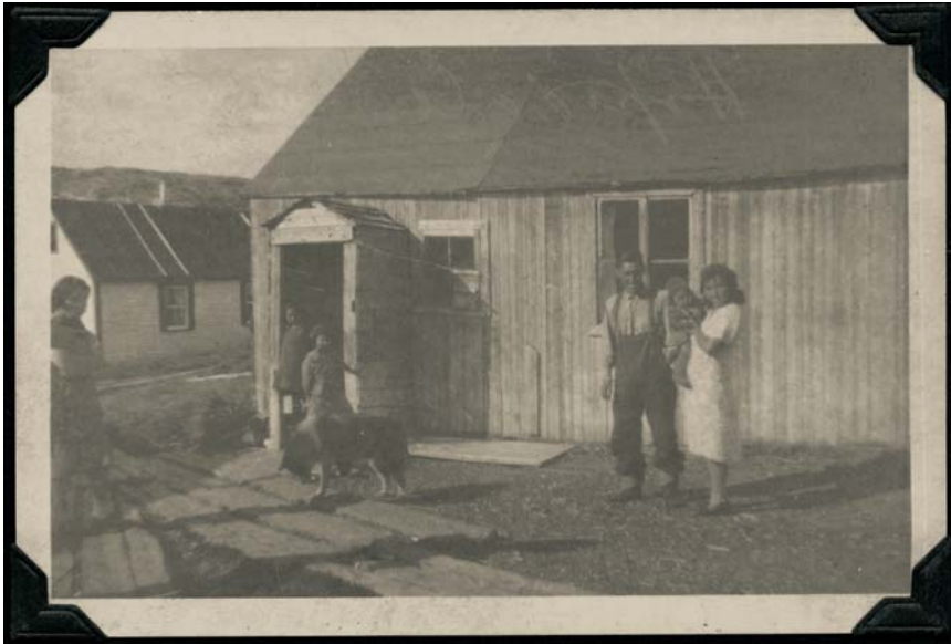
Figure 3. "Eskimos, their home, and one of their huskies — Hopedale."