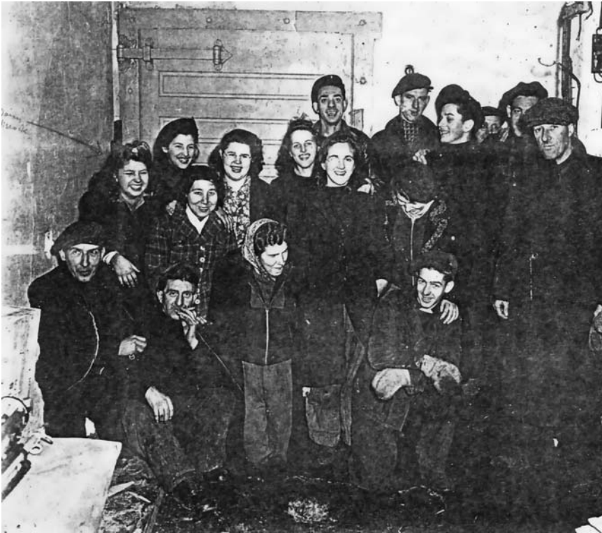
Job's workers in heavy clothing outside cold storage area, c. 1948.