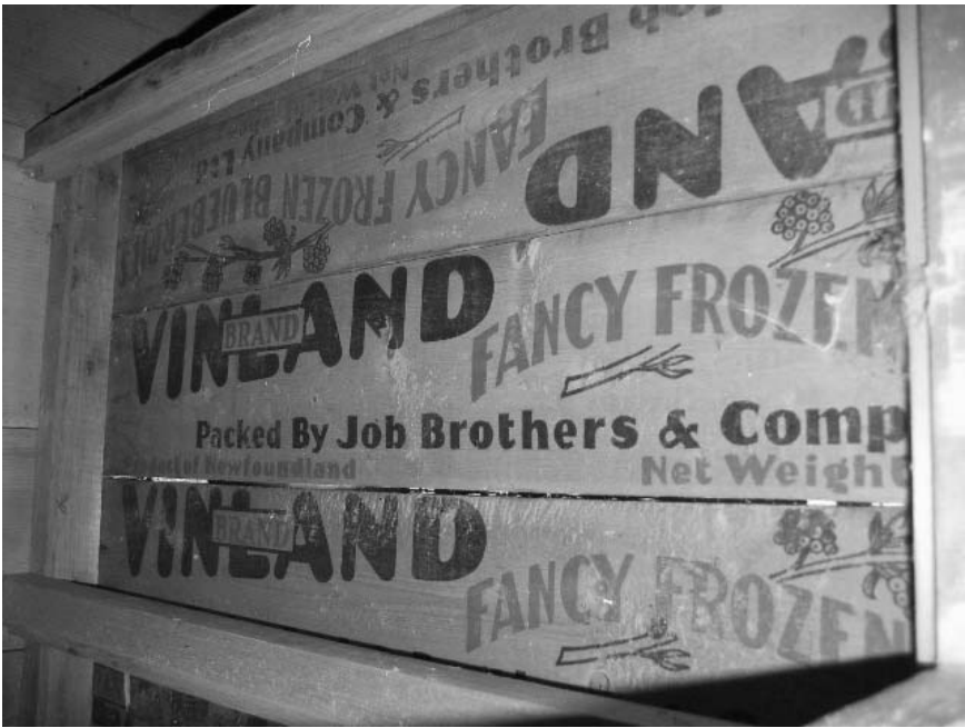
Wooden boxes from Vinland fancy frozen blueberries (photo courtesy of the author, 2007).

ries in lined boxes or cartons, placed “hot wrap” of cellophane around the packages and made them ready for storage, by men, in wooden boxes in the cold storage room.