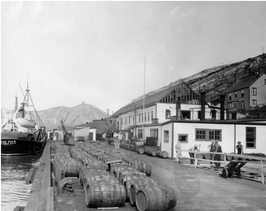
Job Brothers wharf and Southside plant, c. 1950

The Job Brothers processing plant was situated near Prosser's Plantation. It employed both women and men, whose work and numbers changed with developments in the fishery and Job's business interests. From the early decades of the twentieth century, production depended on the seasonal processing round of seals, fish of various species, and, in the fall, blueberries. The fishery had long standing seasonal and gendered divisions of labour, which were replicated within the blueberry industry. Spring seal processing — the flaying (skinning), scrapping, salting, piling, and packing of seal skins for the production of skins and oil — was the work of men. Then small-boat inshore fishermen from the St. John's area, as well as large banking schooners operated by other merchants such as W.W. Wareham or Munroe's, supplied Job Brothers from June to October with fish. 17 The introduction of side-trawlers and other deep-sea fishing technologies in the 1930s and 1940s meant species such as haddock, halibut, flounder, rosefish, herring, and perch were caught in greater numbers. Job Brothers marketed fish products under a number of brand names: Hubay and Labdor brine frozen salmon, Hubay quick-frozen fillets, Flag brand smelts. They handled dried codfish, cod oil, seal oil, seal skins, pickled herring and salmon, canned lobsters and salmon, and fresh, frozen, and smoked fish. Job Brothers marketed their blueberries in the United States under the name