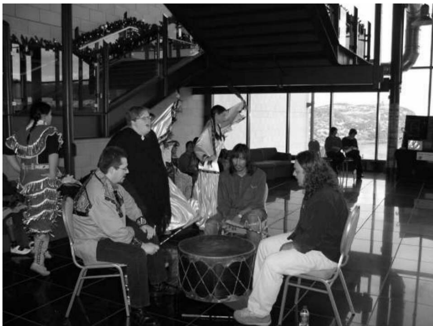
“St. John’s Aboriginal Drumming and Dancing Group at the Multicultural Fair Celebration of Diversity held at The Rooms on Sunday, 11 December 2005.