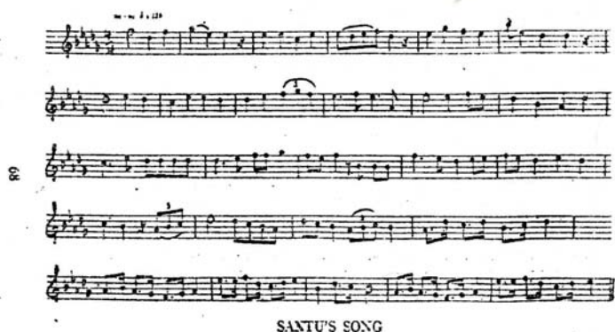
Figure 1. Facsimile of Sapir's transcription.