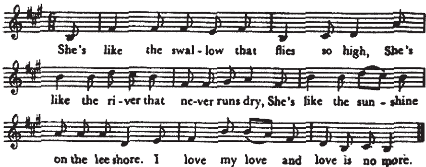
Figure 1. John Hunt's melody as published by Karpeles in 1971. © 1971 Faber Music Ltd. Reproduced by kind permission of the publishers. All Rights Reserved.