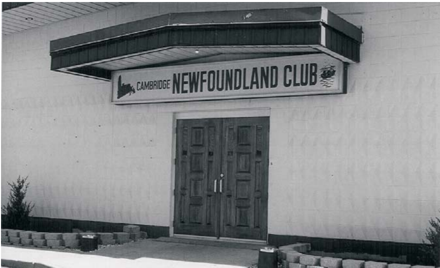
Figure 1. Cambridge Newfoundland Club, Cambridge, July 2002.

Between 2002 and 2005 I made several trips to Cambridge to interview residents, to attend Newfoundland events, and to map out Newfoundland spaces. I attended the Canada Day Newfoundland Reunion at the Cambridge Newfoundland Club in 2002 and 2003 (see Figure 1), as well as Christmas and New Year's parties at the club in 2003 and 2004. During the fall of 2003 I lived in Cambridge and attended various other events as I tried to understand the historical and contemporary role of Newfoundlanders in the region. While doing this study, I likewise became interested in the role of suburban design in the construction of community in Cambridge. Cambridge is a post-suburban community (a distant suburb of Toronto; a suburb without a city where most residents commute daily between a variety of suburban spaces without entering into a city). The role of suburbia and post-suburban identity became a core theme of my study of contemporary Newfoundland community space in Ontario.