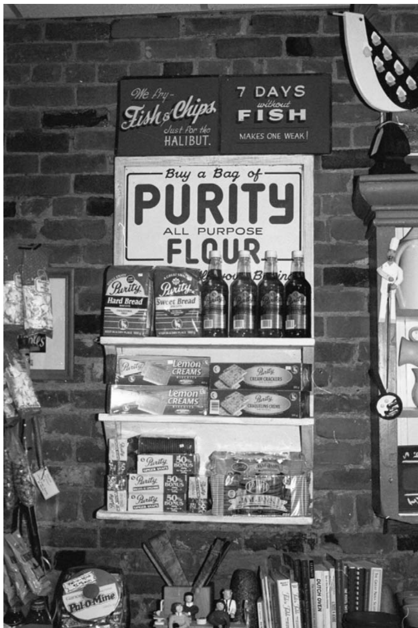
Figure 5. Purity Products on display in Downeast Crafts, 508 Bathurst Street, Toronto, October 2002 (photo by Cory W. Thorne).