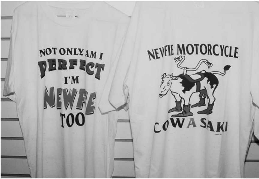
Figure 4. Newfoundland T-Shirts on display at Newfoundland Necessities, 746 Markham Road, Scarborough, November 2002.

sympiotic weakening. As argued by Gerald Pocius in his comparison of vernacular architecture and professional wrestling in Newfoundland, authenticity is not important in the lived realities of everyday life. As with the traditional songs in the canon, these material examples of kitsch are supposed to evoke a sense of nostalgia, and subsequently support the development of communal identity.