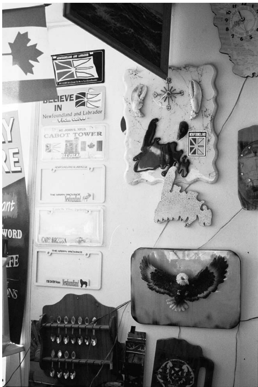
Figure 3. Newfoundland license plate holders, wall clocks, and plaques on display at Claremmichael's Maritime and General Shoppe, 1258 The Queensway, Toronto, November 2002 (photo by Cory W. Thorne).