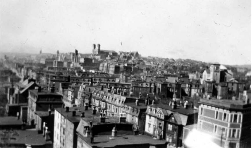
Figure 2. View taken from Mona's room in Newfoundland Hotel, St. John's.

ening clatter as they wound their way along the winding cobblestone roads. "Walking on the streets is quite a hazardous adventure," Mona observed. "The hills are terrific and both the sidewalks (such as they are) and the roads are horribly slippery. There are only a few streets in the city that are paved and so far I have only found pavement on sidewalks of two streets.... We used to worry in Charlottetown about the children sliding [sledding] on the grades, but heavens! that wasn't a patch on what they do here, simply swarms of them on almost every street slipping down the hills onto cross roads with street cars, trucks and what have you." 9 At times Mona missed the amenities of larger Canadian cities. There was no "decent place to go to revive one's drooping spirits with a spot of tea," she lamented to Jane. "Not a good restaurant in the city that is not dear or serves good food — and after 8 pm it is impossible to get a bite in the hotel. What a country! Oh for a Honey Dew or a Murray's." When Mona finally did find something she liked, the storekeepers invariably replied, "'Sorry, but it is out of stock at present,' meaning six months to a year." 10