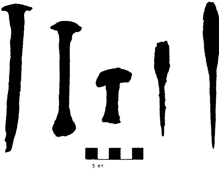
Fig. 2 From the left: wrought iron nail, of a size favoured by Beothuk iron-workers; nail modified, apparently as a scraper; discarded nail head, from which the shaft has been removed; arrowhead manufactured from a nail; another similar arrowhead. (After Pastore 1992: 31).