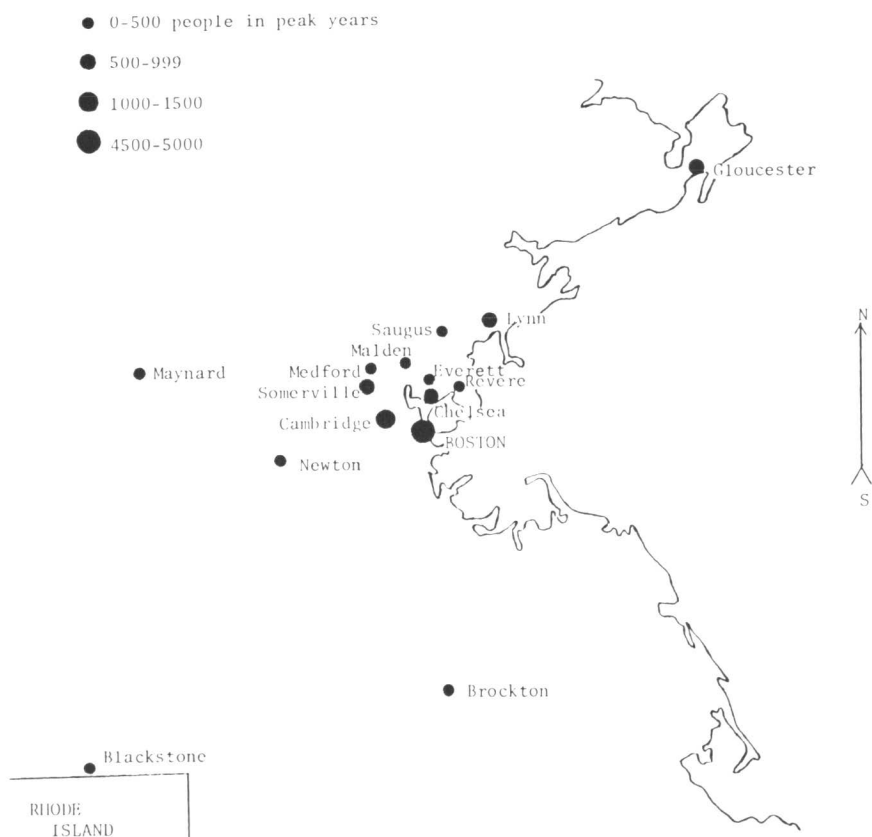
Figure 1. Massachusetts Cities with over 100 Newfoundlanders, 1885-1915

The 1885 data documented the initial movement towards Boston and the fishing port of Gloucester. Once the immigration assumed larger proportions after 1885, Newfoundlanders settled in significant numbers in other cities. The great majority, however, continued to choose Boston and its circle of satellite cities as their destination (Fig. 1).