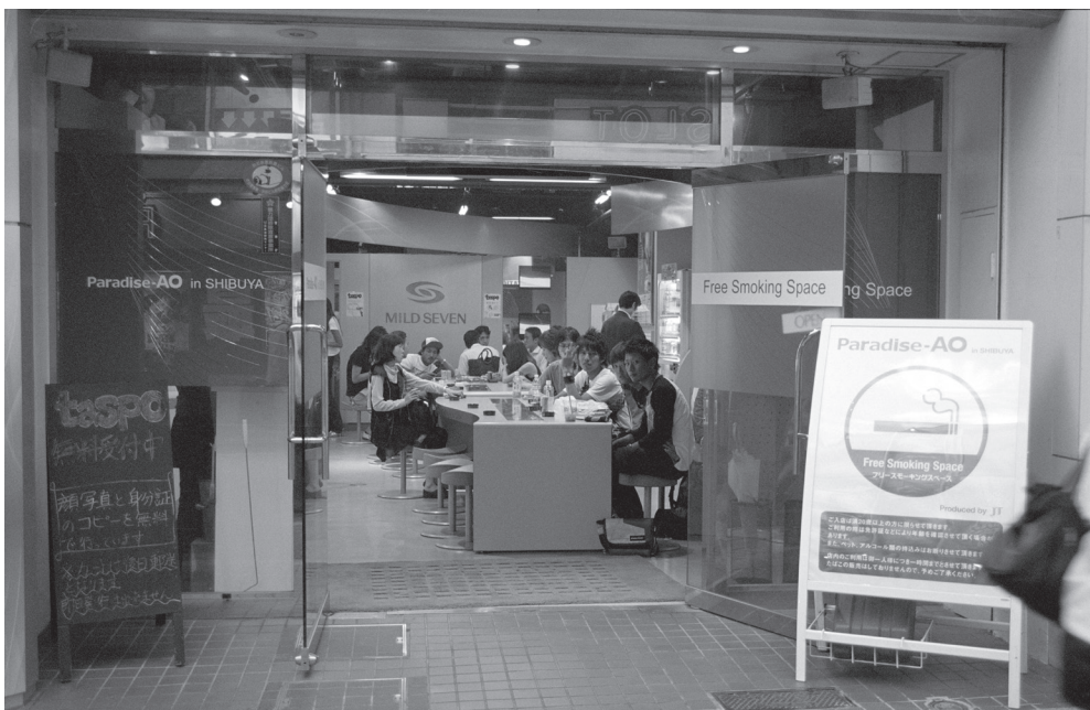
Paradise-AO in Shibuya, 2009

Going on a trip? Whether taking a train across Canada or flying to your favourite destination, you no longer have to worry about the long trips with patches or the white knuckling cold turkey approach.