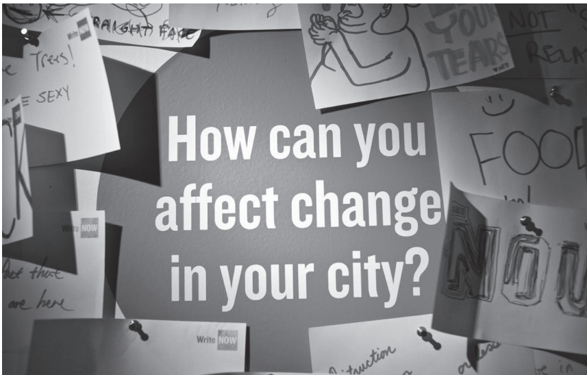
Figure 7 Post NOW comment wall – detail, 2012. Art Gallery of Ontario