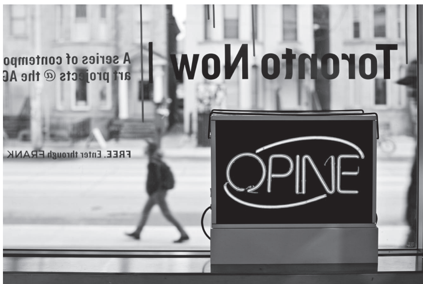
Figure 15 OPEN OPINE – installation view, 2012. Art Gallery of Ontario