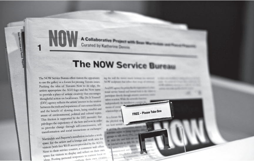
Figure 10 NOW Newspaper – installation view, 2012. Art Gallery of Ontario