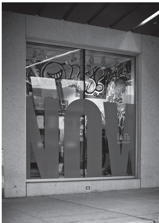
Figure 14 shopAGO window display, 2012. Art Gallery of Ontario