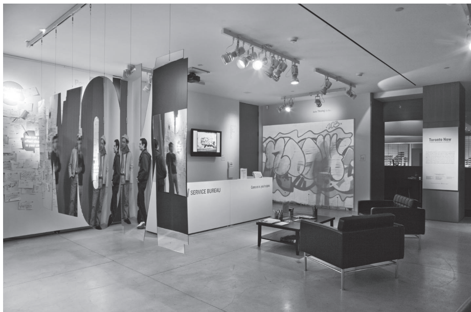
Figure 8 NOW Service Bureau – installation view, 2012. Art Gallery of Ontario