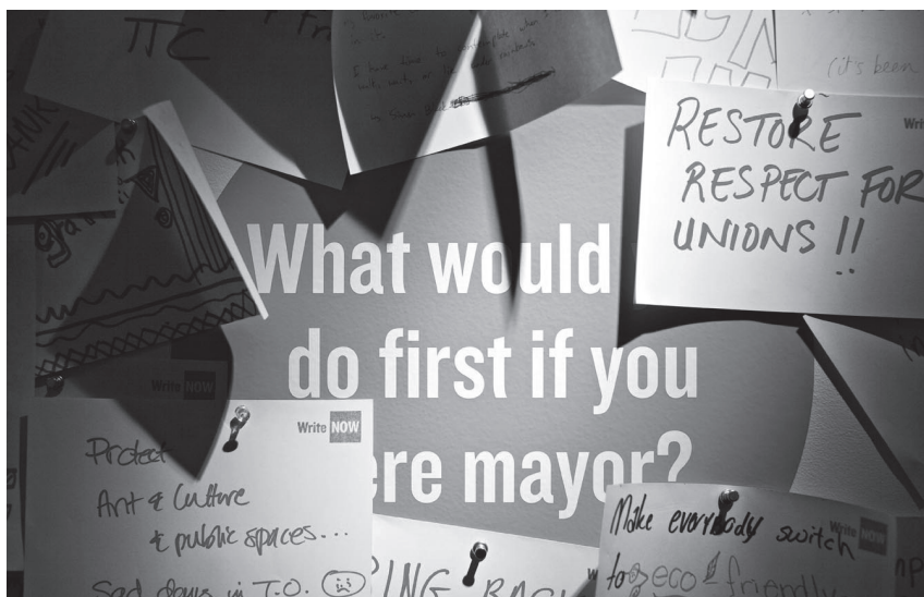
Figure 13 Post NOW comment wall – detail, 2012. Art Gallery of Ontario