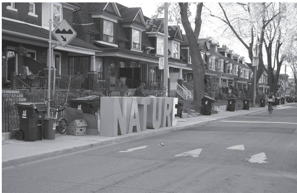
Figure 2 Sean Martindale, NATURE, Public Intervention, Toronto, Ontario 2009 [© Sean Martindale]