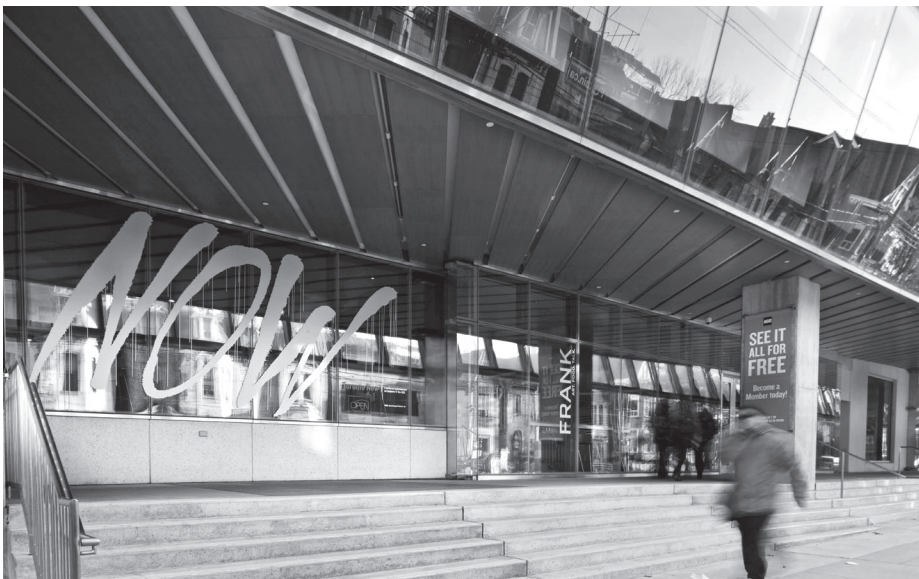
Figure 5 Young Gallery window – installation view, 2012. Art Gallery of Ontario