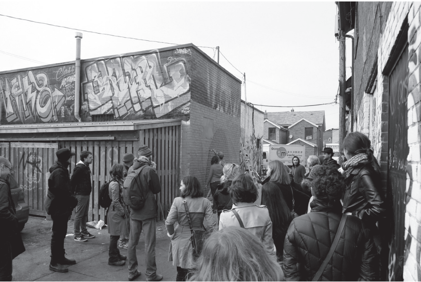
Figure 11 Tagging Along – public program, 2012. Kensington Market