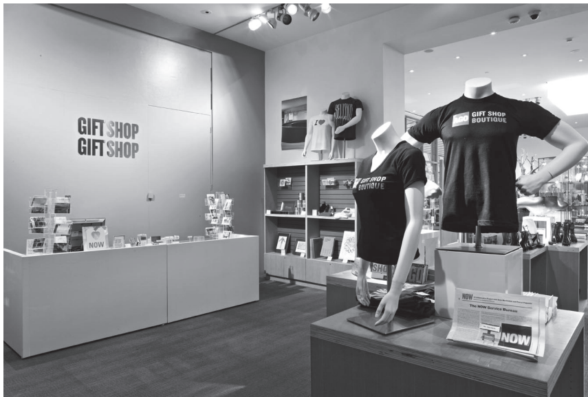
Figure 12 Gift Shop Gift Shop , installation, 2012. Art Gallery of Ontario