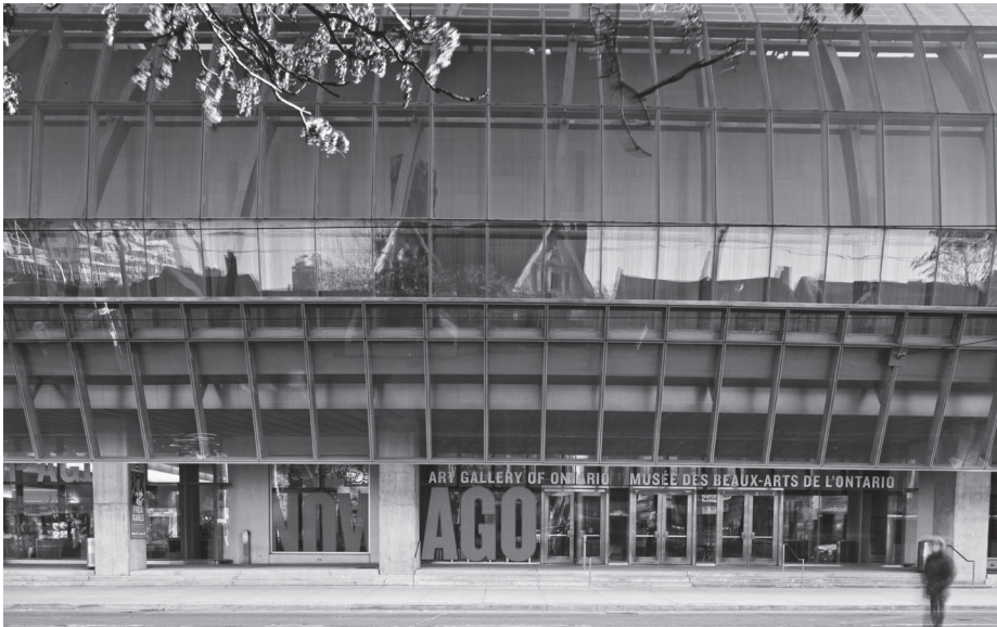
Figure 4 AGO façade, shopAGO window installation, 2012. Art Gallery of Ontario