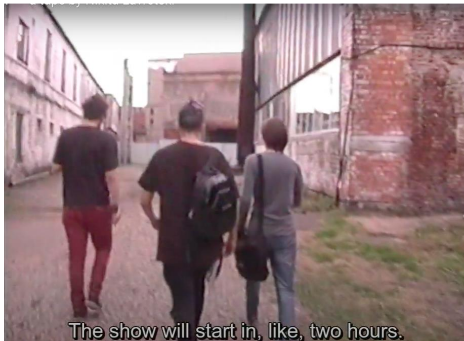
Figures 20 and 21. Sasha's Hell (Lavretski, 2019)