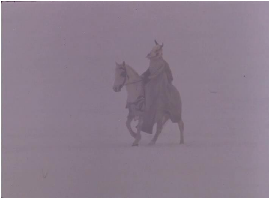
Figures 6 and 7. The Savage Hunt of King Stakb (Rubinchik 1980).