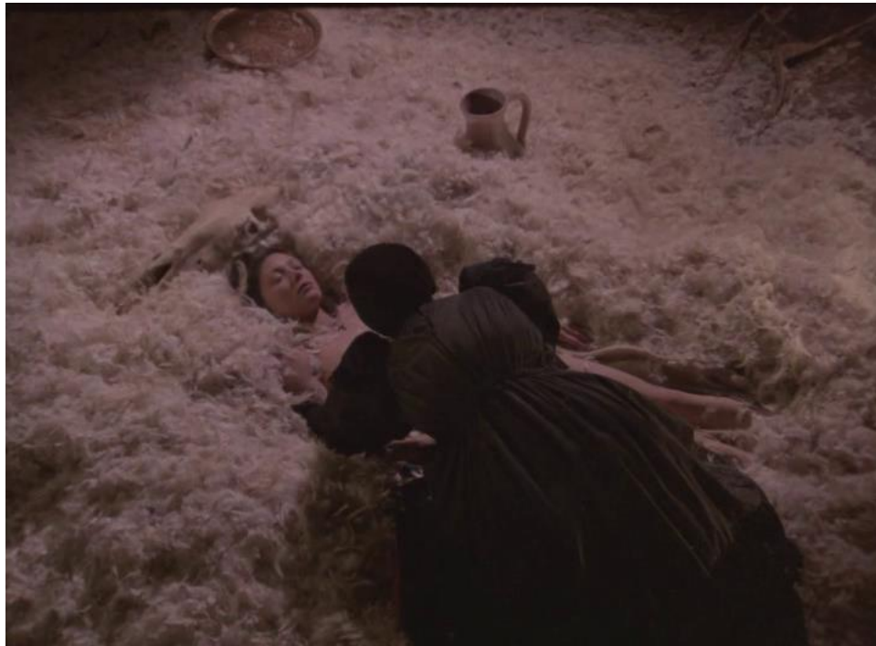
Figure 5. The Savage Hunt of King Stakh (Rubinchik 1980).

latent or imminent epistemology, but rather as intentionally obscured and silenced. To that point, early in the film there is a scene when our protagonist accidentally spies on the countess. He sees her naked and asleep, laid in the large pile of feathers with an old woman muttering some sort of incantations over her.