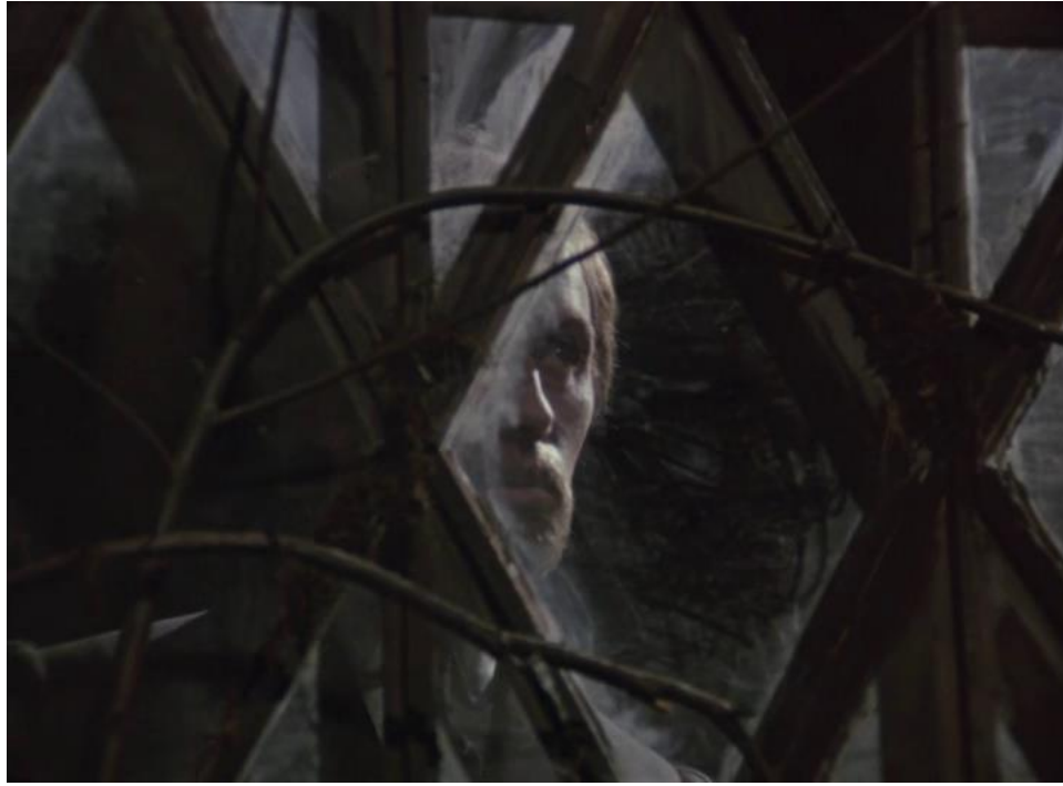
Figure 4. The Savage Hunt of King Stakh (Rubinchik 1980).

These obscured, partial views are usually presented at a moderately low angle as if the camera were peeping in on the action from the height of a tall child. The camera work, in short, destabilizes the assumptions of agency and perspective in the film. We never find out who is watching from the camera POV, and the film consciously teases the viewer about it. The Hunt features a little person character, the brother of the housekeeper hidden in the dungeons of the mansion, who initially is presumed to be a vengeful “little man” spirit haunting the countess. When the brother is discovered by the others, we quickly realize that it is not his perspective we see. In fact, we never find out whose obstructed perspective the camera adopts so rigorously in so many sequences in the film. I believe the film intentionally plays with the conventions of knowable and visible, erecting barriers to visibility and casting doubt on what is truly knowable in the story.