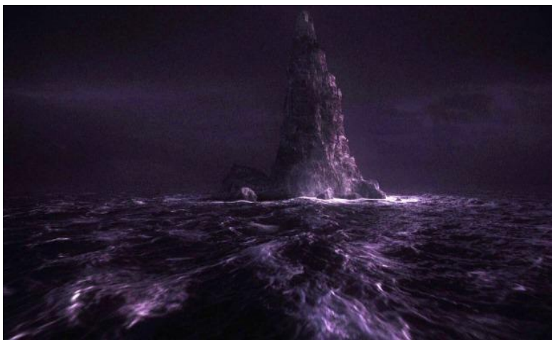
Figures 17 and 18. Twin Peaks: The Return (Lynch, 2017)