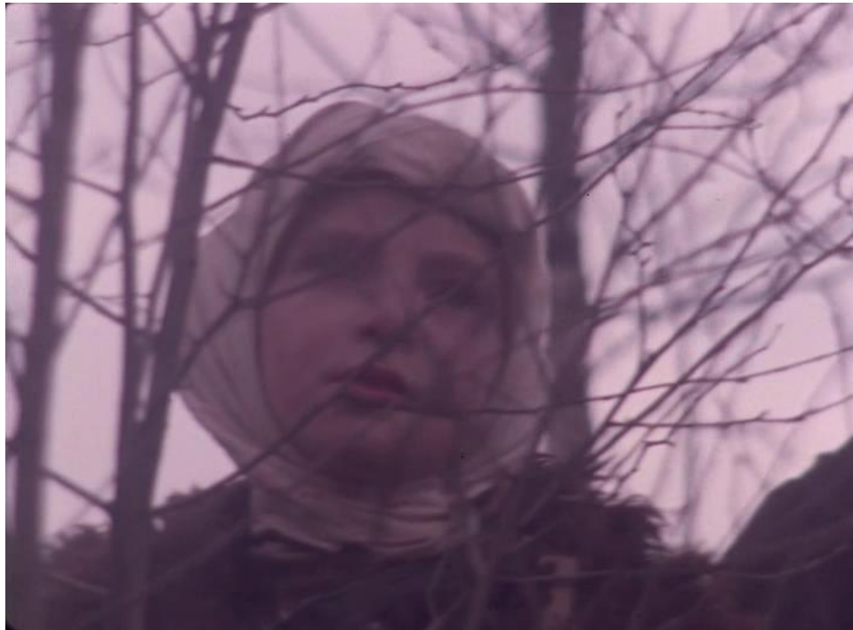
Figure 8. The Savage Hunt of King Stakh (Rubinchik 1980).

A police officer happily intones that this is the first day of the 20 th century, and he is excited to travel to Petersburg even if for police business. The film ends with a long shot that tracks across faces of the local children. They stare silently and emotionlessly at the panning camera and through the branches and twigs that grow from off screen space to obscure the frame. They are neither afraid of the close ghostly presence nor saddened by our visitor's departure. Suddenly, it is less clear if the ghostly cavalry truly exists, and if the children, whose plight of living in fear moved our visitor to action, are in the know about it.