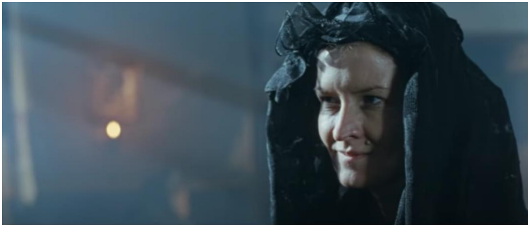
Figure 12. Masakra (Kudzinienka, 2004)

fragile and flammable, falling apart like they are made of sand and serving as the fuel for the final masakra . I believe the straw objects represent the disconnect at the heart of our characters' struggle. Like the straw puppets of the ghostly hunt, they represent the failure of Belarusian landed gentry to be faithful stewards of the land. The Belarusian nobility like the count or his fiancée appear to have a tortured relationship to the land that surrounds them and people who live on it. The count exemplifies it particularly clearly: his desire to escape the curse is a desire to stop being who he is, which is both a bear and a Belarusian. The same can be said about Anna: not only she is ambivalent about her engagement, but her escape and return are not of her making. Instead, her descent into insanity is engineered by the local women. One of them approaches Anna in the church and urges her to return to the mansion because Anna is the only one able to set things right. The woman then utters the word “ masakra ” with a satisfying smirk.