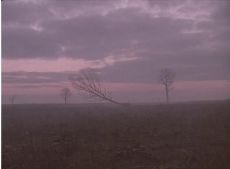
Figure 1. The Savage Hunt of King Stakh (Rubinchik, 1980)

the cursed hostile land, the vengeful ancestors, and death as deliverance from this nightmarish existence.