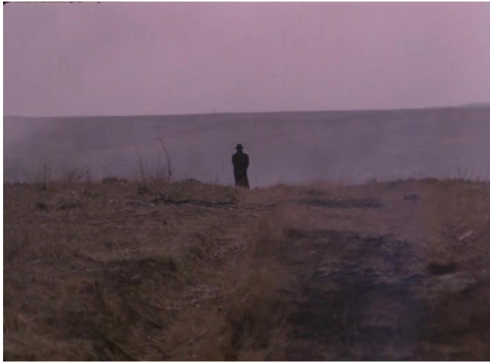
Figure 2. The Savage Hunt of King Stakh (Rubinchik 1980).

Both characters in the end leave the provincially coded Belarus for the metropolitan Petersburg. Belarus appears in the film as a gloomy landscape filled with fog and bog, where things are expected to take a bad turn. The isolation of the characters is made palpable through long shots that emphasize small human frames set against vast, desolate landscapes.