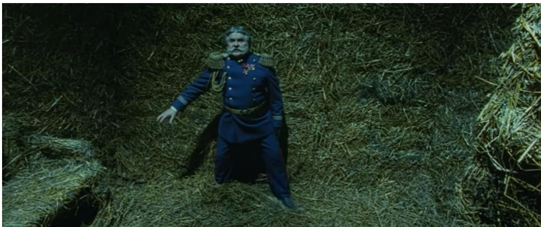
Figures 10 and 11. Masakra (Kudzinienka, 2004)

The introduction of straw in Masakra does not seem to be connected to the incursion of nature like in The Hunt , where the creeping vegetation symbolized decay and outmodedness. The prominence of straw is less self-explanatory. Everyday objects and architectural features made of straw are