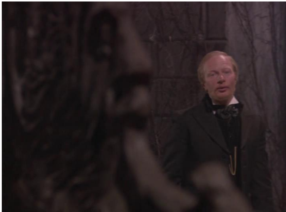
Figure 3. The Savage Hunt of King Stakh (Rubinchik 1980).

The camera work in the film features a consistent visual technique: almost every shot is partially obscured. Trees and vegetation obscure the view outside, and inside doorways, walls, and interior objects intrude on the frame. The technique is so persistent that at several points in the film it feels almost haptic. The viewer might experience a strong urge to reach into the screen and remove the obstruction: to brush away out-of-focus branches, or to move an object placed right in front of the camera (figures 3 and 4).