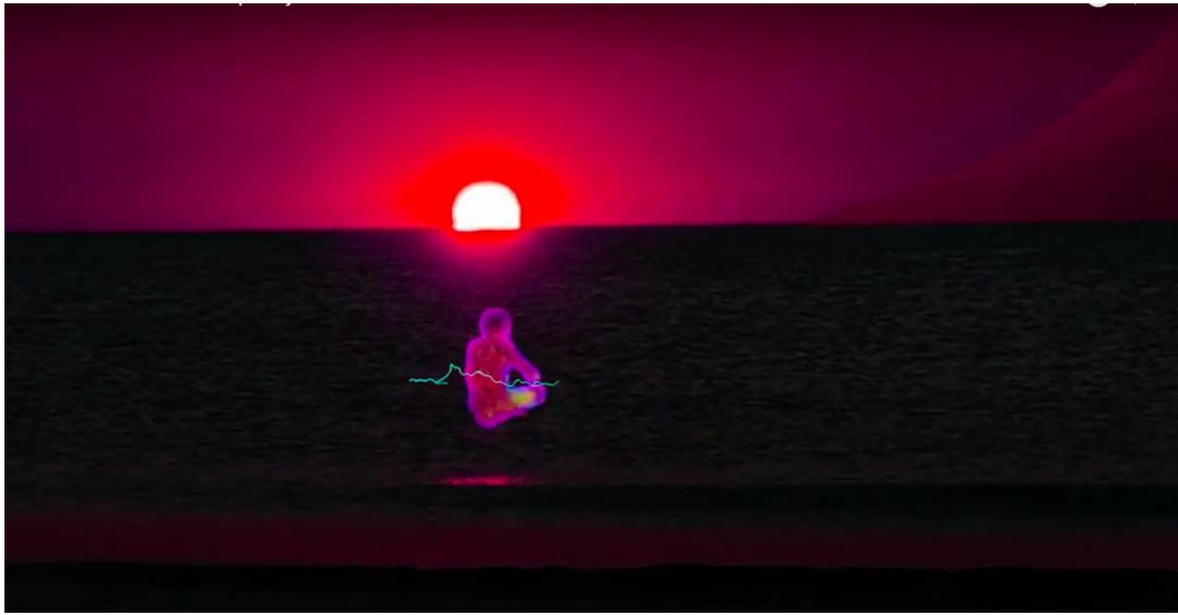
Figure 16. Sasha's Hell (Lavretski, 2019)