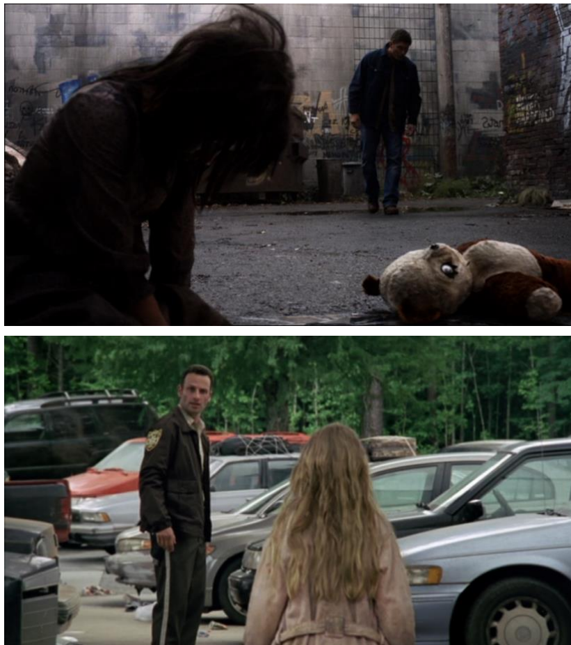
Figures 2 and 3: Dean and the zombie child in “The End” (top); Rick Grimes and the zombie child in “Days Gone By” The Walking Dead (1.1) (bottom).

Dean wakes up, like Jim in 28 Days Later and Rick Grimes in The Walking Dead (2010-), in a post-apocalyptic landscape (Figure 1). The city is empty of life, the buildings have been bombed, cars have been torched, and the streets are filled with debris and decay. Unclear as to what has transpired, Dean finds a young child crouching over a teddy bear and when he approaches to help her, he suddenly sees blood dripping from her mouth as she turns and violently attacks him. This scene is notably similar to the opening of the television series The Walking Dead (“Days Gone By” 1.1), including the child and teddy bear and Dean and Rick both calling out “little girl” as they approach the zombie-child (Figures 2 and 3). 2