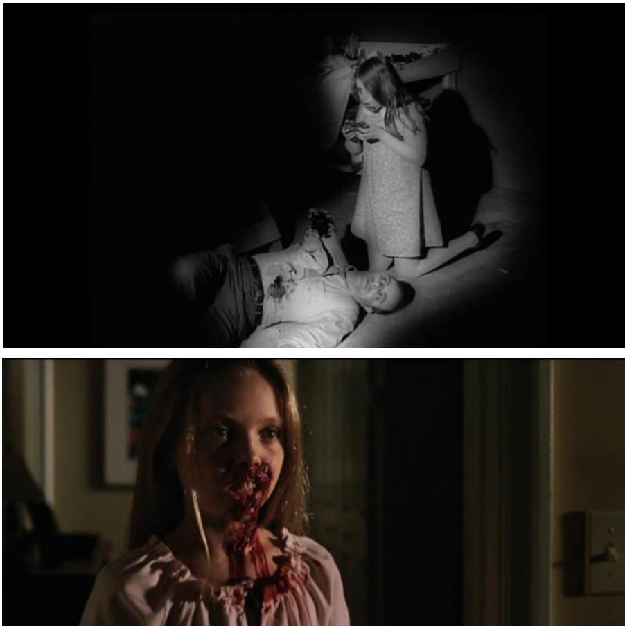
Figures 4 and 5: The zombie children in George A. Romero's Night of the Living Dead (1968) (top) and the 2004 remake of Dawn of the Dead (bottom).

Both owe a debt to Karen in George Romero's Night of the Living Dead (1968) who murders and eats her parents and, arguably, Vivian the zombie-child in Snyder's Dawn of the Dead , whose emergence from the shadows wearing a bloody nightgown and bite marks on her face similarly marks the protagonist's first confrontation with a zombie (Figures 4 and 5). "The End" therefore positions Supernatural within an extensive tradition of zombie apocalypse narratives. After Dean knocks the little girl down, he sees the word Croatoan graffitied on the wall just as a large group of infected adults turn up and chase him through the city, linking the pre-apocalypse experiment of "Croatoan" with this post-apocalypse vision. Dean may have gone to sleep in a world preparing for a holy war, but he woke up in a zombie apocalypse in which humanity is destroyed or transformed through viral infection.