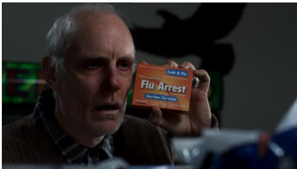
Figure 6: The flu pandemic in “Hammer of the Gods” 5.19.

Sam and Dean realise that to stop Lucifer they need to find the two remaining Horsemen of the Apocalypse—Pestilence and Death—the episode cuts away to an older man, suffering from flu, as he enters a gas station convenience store. His skin is blotchy, suggesting fever, and he has a dripping red nose (Figure 6). As he moves through the store, he repeatedly sneezes and leaves a trail of mucus over everything he touches. A newspaper is glimpsed in the scene with a headline declaring that a new strain of flu is spreading across the USA. The flies that collect around this man signal that he is Pestilence and that his contribution to the coming Armageddon is in the form of a pandemic.