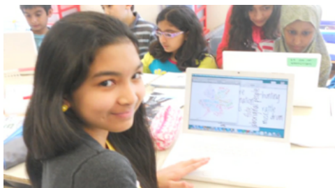
FIGURE 2. Creating a Tagxedo