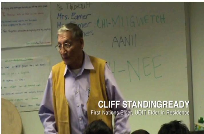
FIGURE 8. Still photo from video footage of First Nations Elder

As Diana notes, it is difficult to decide what to include and what to omit as each decision serves to tell the story in a different way. We made decisions based primarily on the quality of the photos, but also tried to ensure that we included both boys and girls, and gave voice to the teachers and guests in equal measure. Video clips of a Lakota elder (see Figure 8) and award winning aboriginal musician Tracy Bone (see Figure 9) shown engaging with the students enable the viewer to experience, in part, what the students experienced in person. Snippets of student generated digital texts offer the audience a glimpse of the learning that took place from the student's perspective. The research documentary, Exploring Social Justice Through Digital Literacies (Hughes, 2013) can be viewed on YouTube at: http://www.youtube.com/watch?v=dZOt6RDhkVY . 1