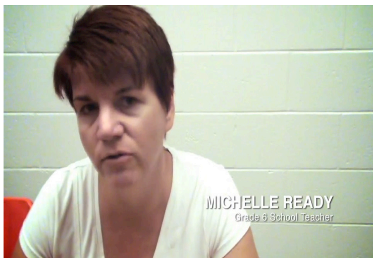
FIGURE 7. Still photo from interview clip with classroom teacher