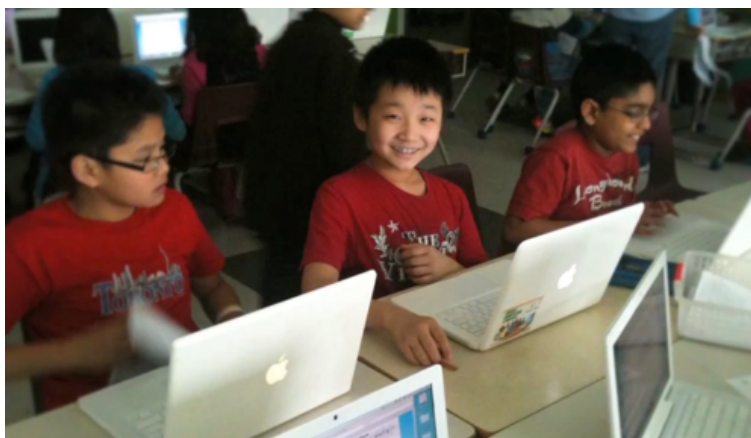
FIGURE 6. Working on MacBooks

the researcher, explaining the research and the activities the students engaged in throughout the study. This framework enabled us to better structure the documentary and kept us focused on our purpose, which was to make the research findings more accessible to the general public. The juxtaposition of the scholar speaking about the purpose of the research with various still shots and videoclips of the research project offers the audience a rich and more personal look into the research itself. Still images of the students engaged in learning activities (see Figure 6) are interwoven with the classroom teachers commenting on the project (see Figure 7).