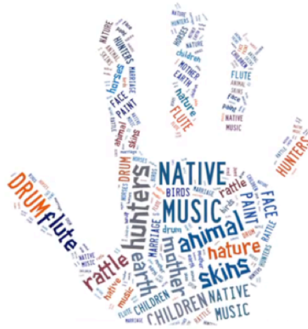
FIGURE 3. Student Tagxedo

Just like a traditional article, our documentary included images of student work and comments by students and teachers. The difference in a documentary is that we see these on a video, which tends to be more intrusive and shares much more evidence than a static picture – ethically, decisions about which videoclips to include requires much more scrutiny. As part of our research protocol we obtained district school board, parental and participant consent to use the still images and video footage; however, even though students and parents gave permission in advance, we asked students again before video taping whether it was okay to record them or take a photo of their work. If they hesitated or we sensed that they were not comfortable, we did not proceed. As noted earlier, we also had a camera set up to record classroom activities at all times so they were sometimes unaware that they were being recorded. Because we felt this was obtrusive, we showed the documentary to them before it was made public in order to confirm that the way they were represented was acceptable. We found that students and teachers were equally eager to appear in the documentary. Sharing educational research through performance-based video clips with educators, parents and the public in general helps make research findings tangible and accessible.