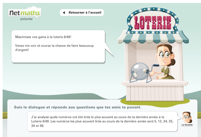
FIGURE 2. Lottery 6/49 home page

created in line with the Quebec mathematics curriculum were pertinent to the New Brunswick context, but with minor modifications. The tools could help students create links among different subject areas and also between different branches (domains) in mathematics. The teachers' concerns were mainly related to the use of the virtual tools in supporting students to develop their mathematical competencies and about the cross-curricular competencies – both envisioned by the provincial curriculum. Beyond the learning outcomes specific to the mathematics curriculum, teachers said that the simulators could help students develop their critical thinking toward games of chance and gambling, which according to them, is an important aspect of cross-curricular learning. The resources concerning virtual simulations enabled students to gain a sense of probability scenarios without engaging in actual gambling. Figure 2 presents the Lottery 6/49 home page, where students were asked to play and test some ideas.