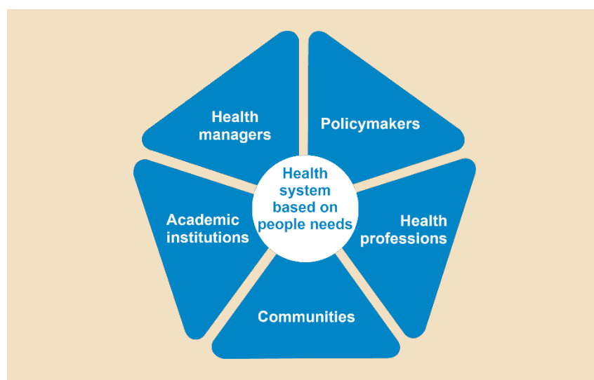
Figure 1 Towards Unity for Health (TUFH) Model