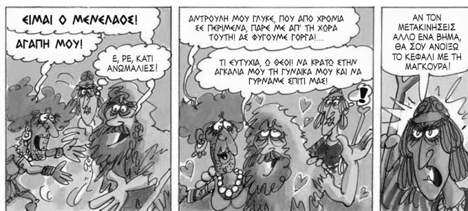
Example 4a: Euripides-Mnesilochus (LD/39)