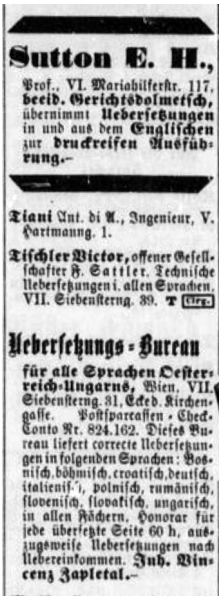
FIGURE 2 Advertisements of translation bureaus (from Lehmann 1903:744) 13