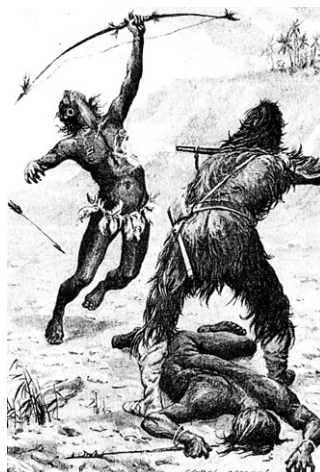
Crusoe killing a cannibal