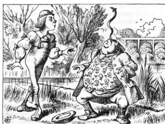
Father William balancing an eel

“You are old,” said the youth, “one would hardly suppose That your eye was as steady as ever; Yet you balanced an eel on the end of your nose – What made you so awfully clever?”