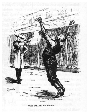
The death of Boggs