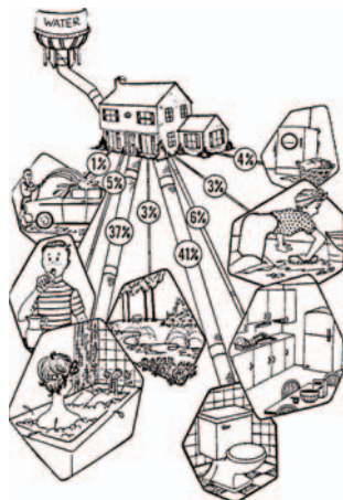
Figure 5. Image used to illustrate the concept water demand

There are many instances in which scientific images can pose an ideological bias. The following image inaccurately illustrates the concept water demand . The presence of an image transmitting sexual stereotypes might suggest the need to search for further bias in the textual frame.