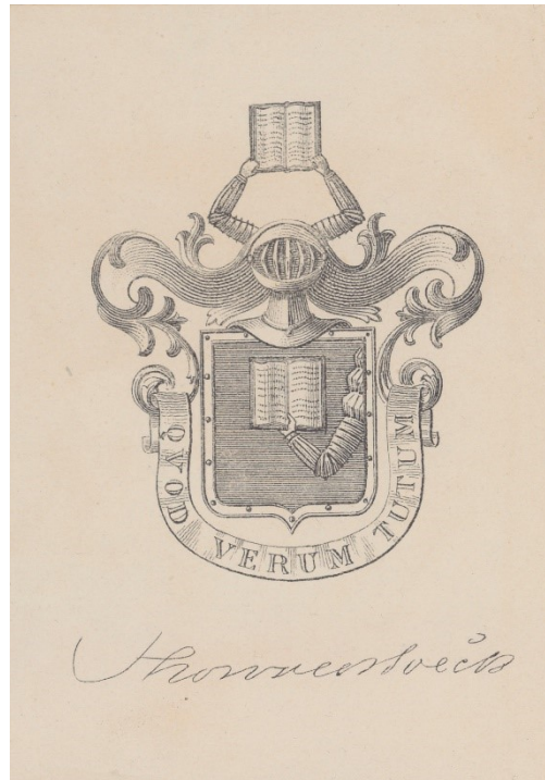
Figure 2: Boeck's ex libris .

this tells us that Boeck respected these rough artefacts of the printer's trade, and that he wanted to take good care of them.