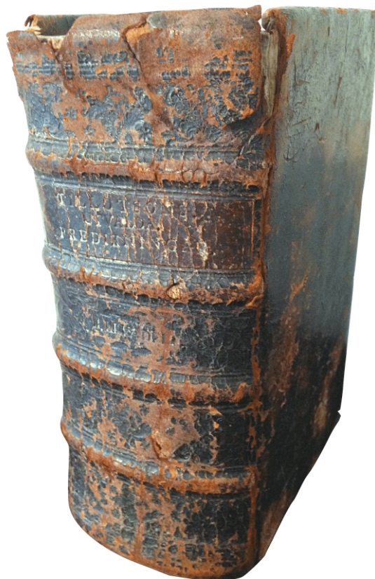
Figure 1: Tillotson's Utwalda predikningar .

covered in fine cracks: subtle evidence that the book had been read numerous times. There! A dog's ear. There! A couple of fingerprints in ink. And there! Faint pencil lines marking paragraphs and chapters of particular interest to a reader. Everywhere, traces of reading. How many evenings were spent poring over this book, how many hours of reading in poor lighting, after a long day's work?